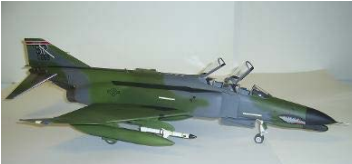
Revell 1/32 F-4G Phantom.

Jerry Used Quickboost resin seats, Speed Hunter Graphics decals and Master Model pitot tube, otherwise OOB.