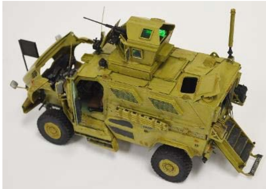
Art Berdick's M1224 Maxx Pro MRAP