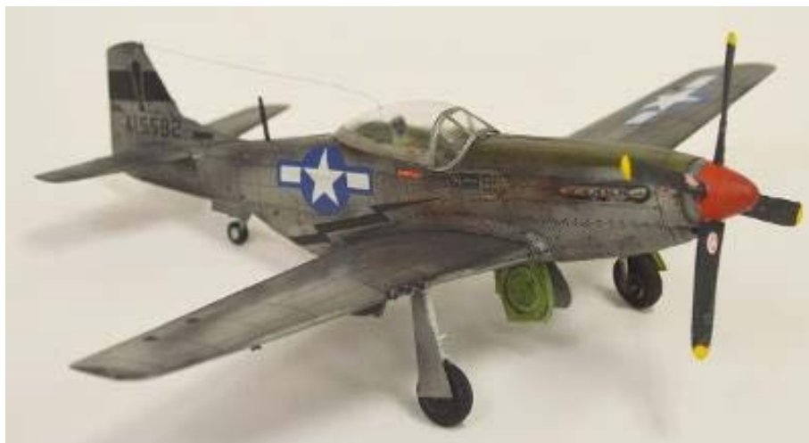
Carlos Delgado's P-51D in 1/48 th scale