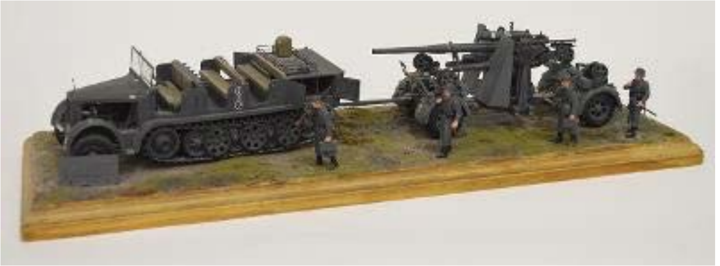
Art Berdick's 11-ton Halftrack with 88mm AT gun