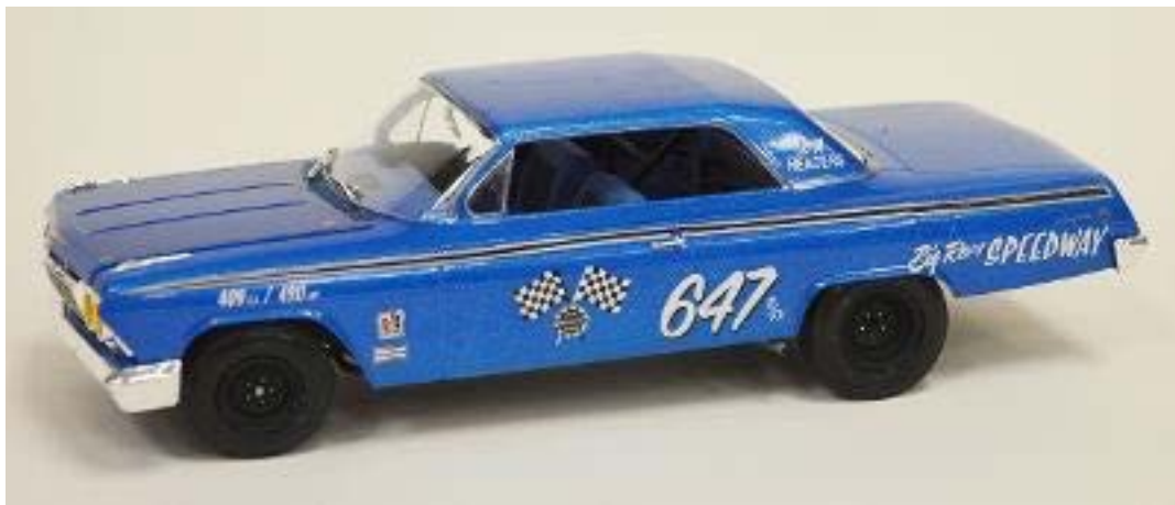
His 1962 Impala SS off the transporter