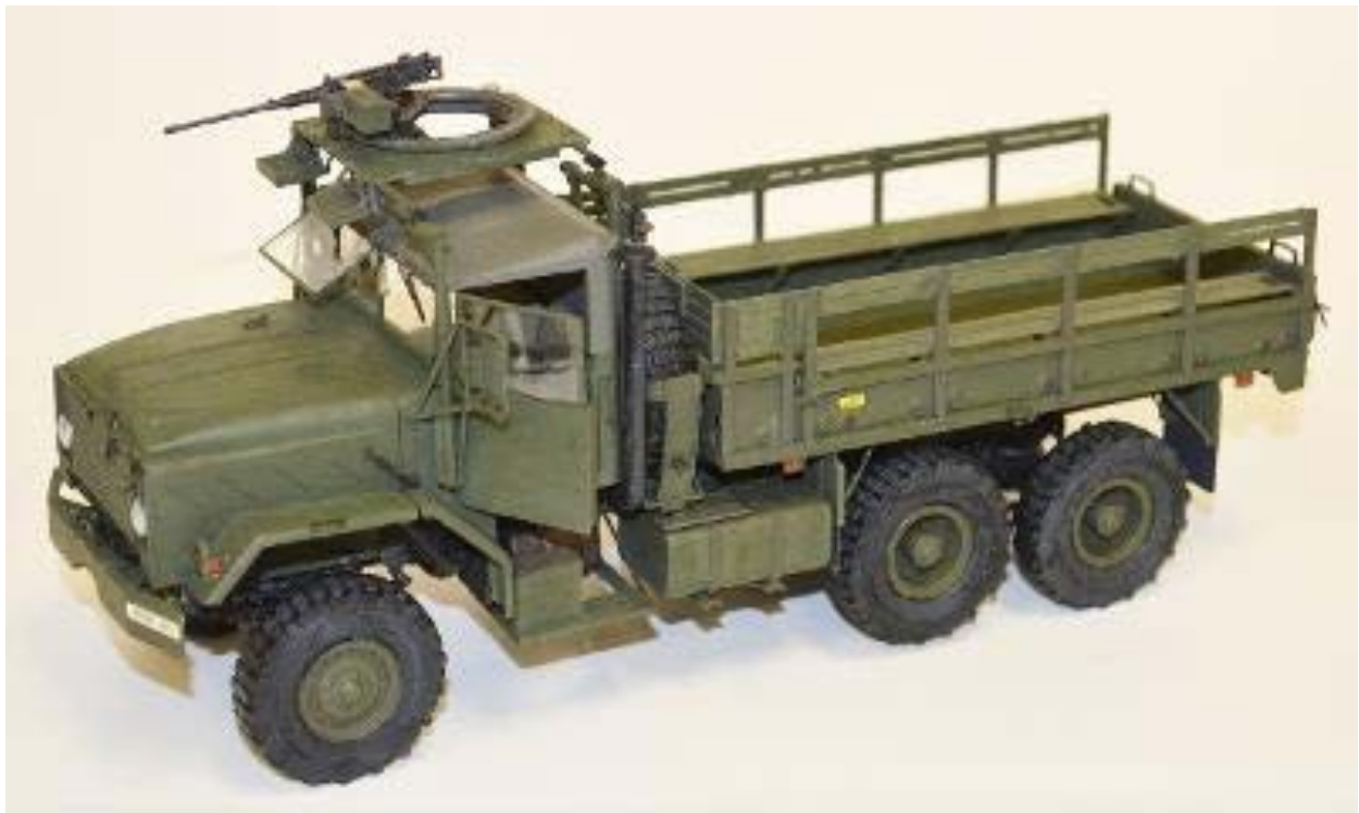
Art's M923A2 5-ton Truck

Art used the ICM kit of the Australian Army Model T, in Palestine., circa 1918. He used the Tamiya kit for the 11-ton half-track and 88 mm Anti-tank gun. Both are in 1/35 th scale. The M932A2 was built from a "I Lovekit" also in 1/35 th scale.