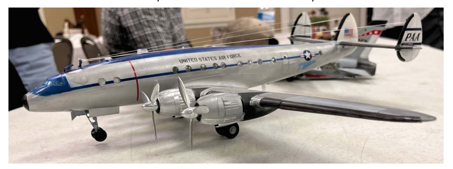
Carlos Delgado's Lockheed "Constellation"

Tractor Races are in 32mm scale using Bombshell Miniatures as the basic starting point. The Toyota 4unner is from an Aoshima kit in 1/24<sup>th</sup> scale. The Focke Wulf 183 Huckebein: is 1/48<sup>th</sup> scale and built from the Academy kit. All are the work of Cliff Bailey.