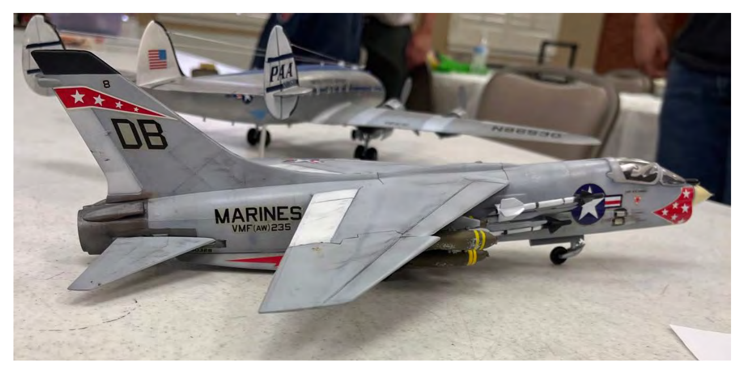
Carlos Delgado's F-8 Crusader

Tractor Races are in 32mm scale using Bombshell Miniatures as the basic starting point. The Toyota 4unner is from an Aoshima kit in 1/24<sup>th</sup> scale. The Focke Wulf 183 Huckebein: is 1/48<sup>th</sup> scale and built from the Academy kit. All are the work of Cliff Bailey.