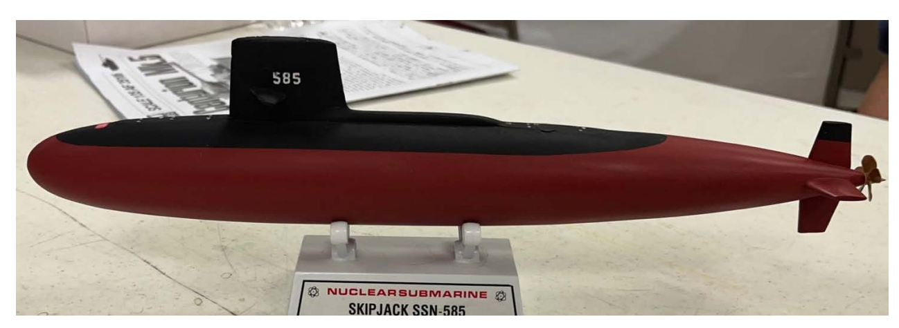
Clifford Bossie's USS Skipjack

Some of the membership participated in another Bassett Place Display on July 22.