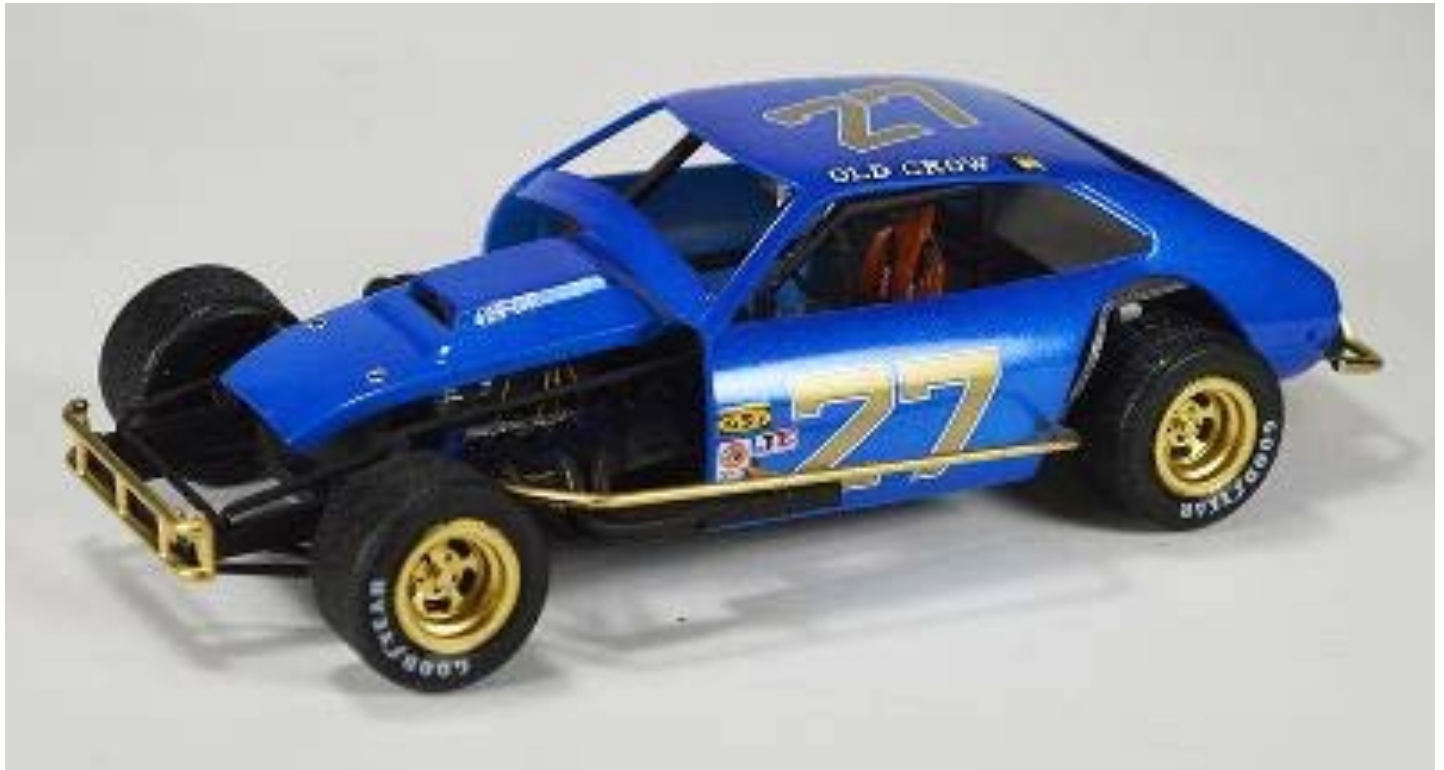
Hector Gonzalez's MPC 1/25th scale Pinto Diet Racer