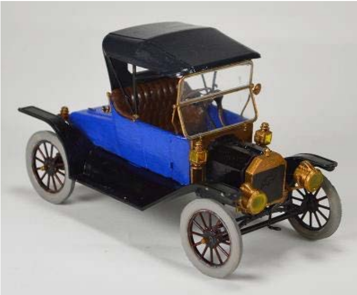
Arthur Berdick's 1/24 th scale ICM 1913 Model T Roadster