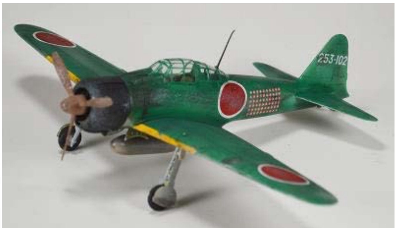
Carlos Delgado's Tamiya 1:48 scale Zero