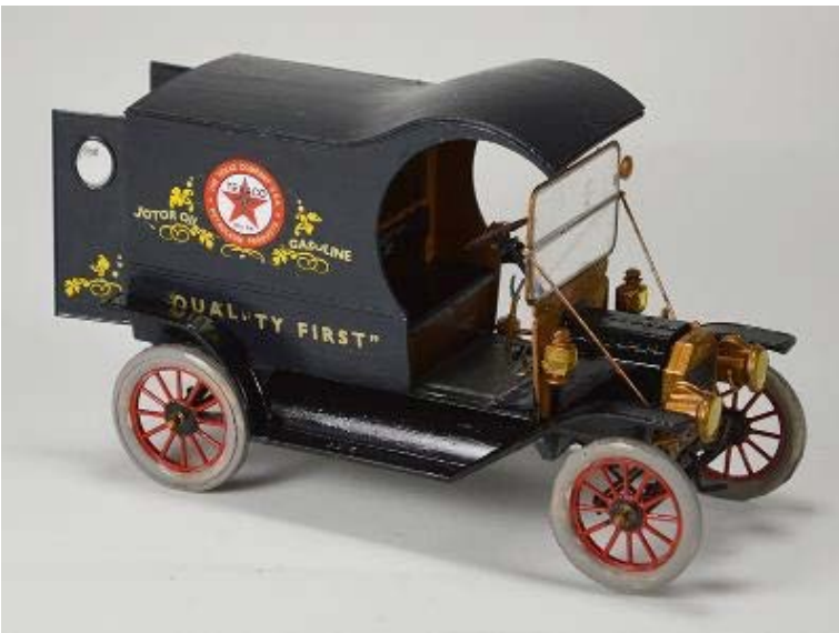
Arthur Berdick's 1/24 th scale ICM Model T 1912