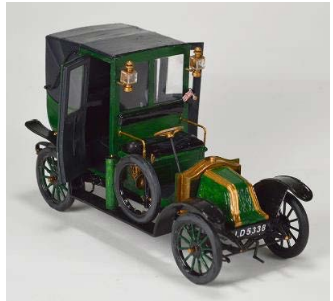
Arthur Berdick's 1:24 scale ICM Type AG 1910 London Taxi