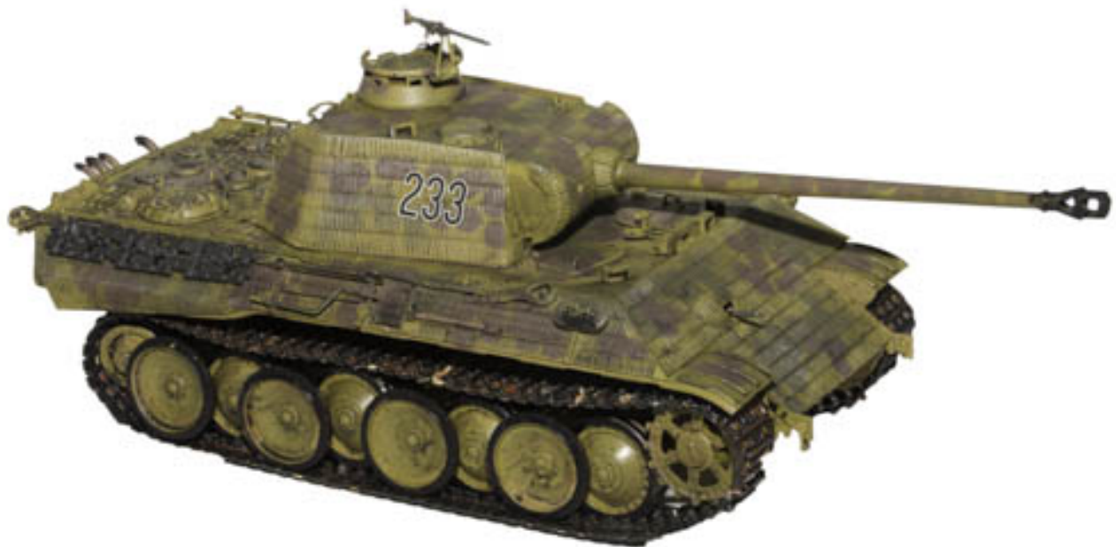
Carlos Delgado's Panther in 1/35 th scale