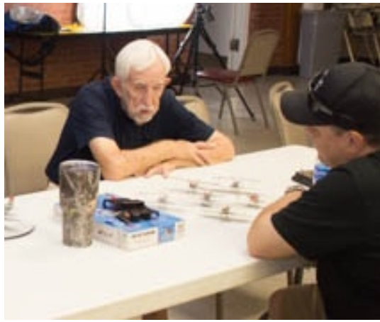
John Paul Jones