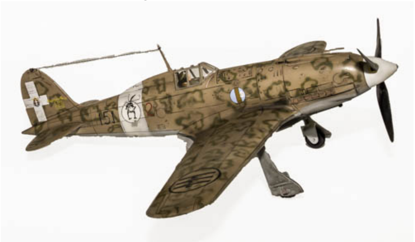
Carlos Delgado's 1/32 nd scale MC 202 Folgore