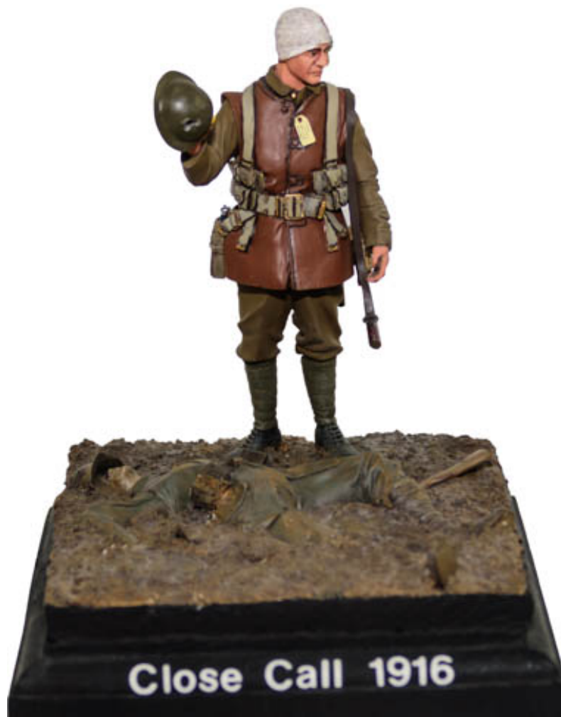
David Torres's Close Call in 120mm scale