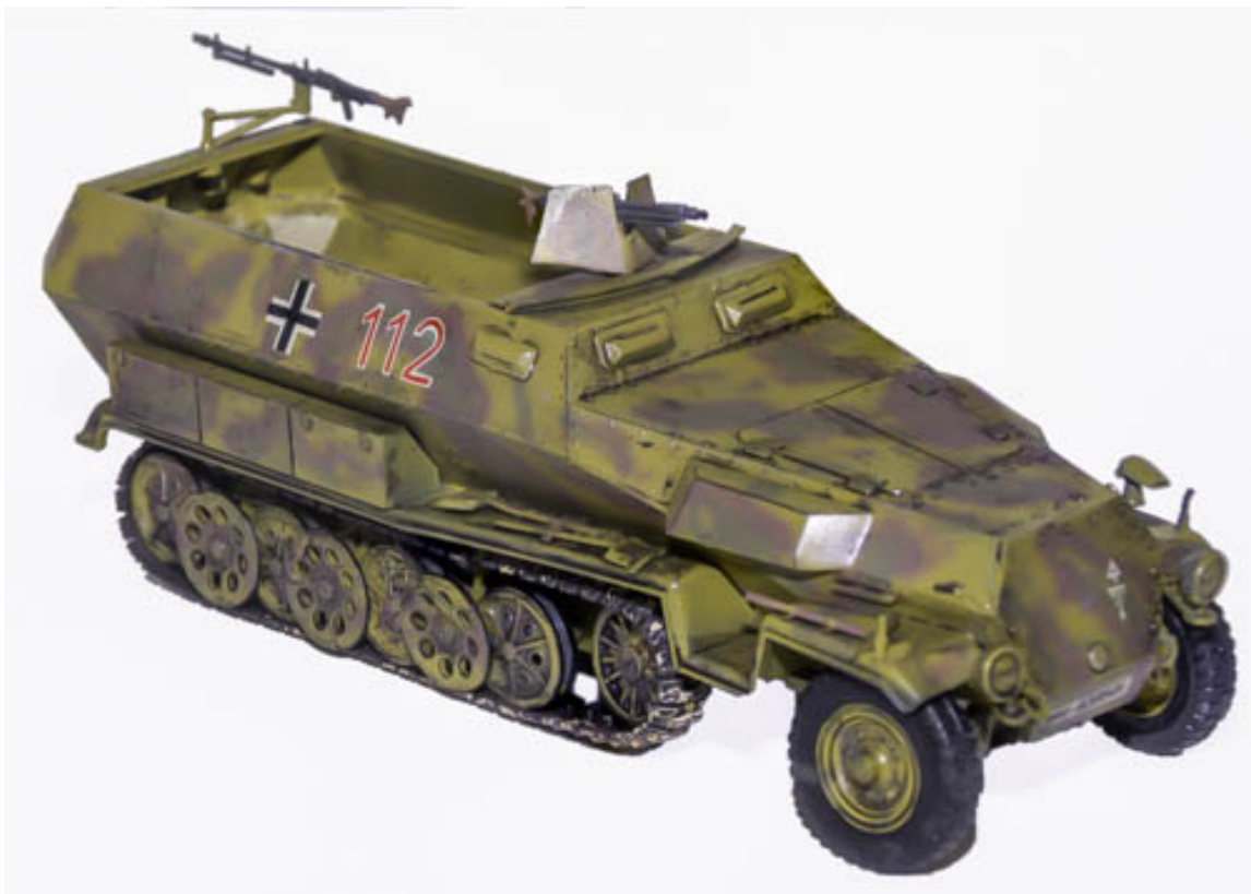
Carlos Delgado's Hanomag Half Track in 1/35 scale