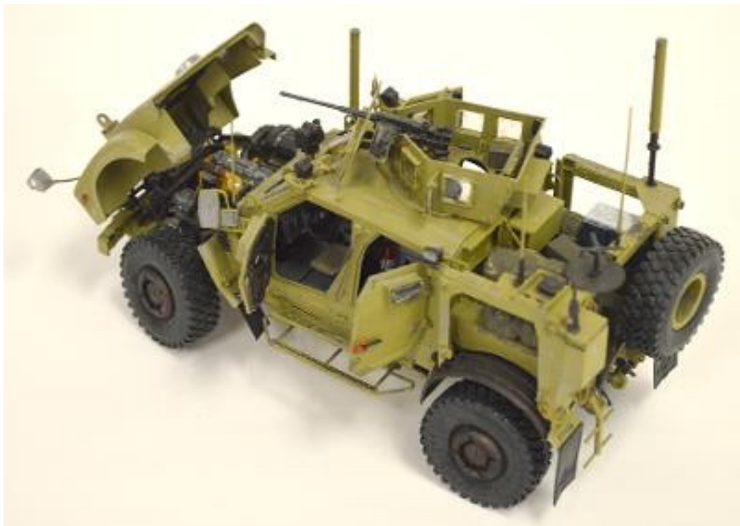
Art Berdick's 1/35 Scale U.S MRAP All Terrain Vehicle M1240A1 M-ATV Built from the RFM kit.

Clifford used the Zvezda 1/35 th scale kit for this build.