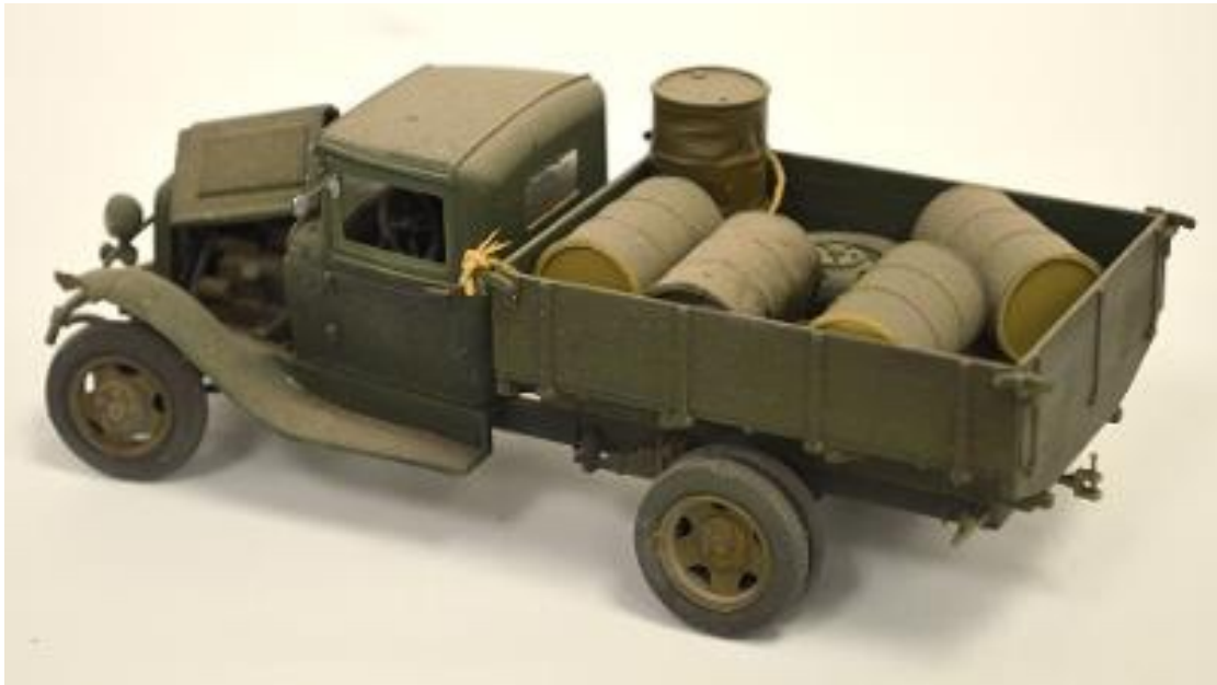
Clifford Bossie's GAZ-AA Truck

Clifford used the Zvezda 1/35 th scale kit for this build.