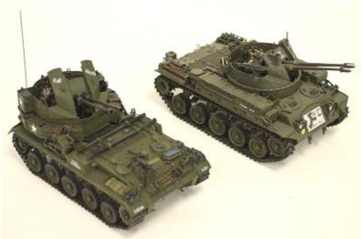
Art Berdick's M-19A1 and M42 Duster in 1/35 th scale

Art used the Bronco kit for the M19A1 and the AVF kit for the M42. The scale is, of course 1/35 th .