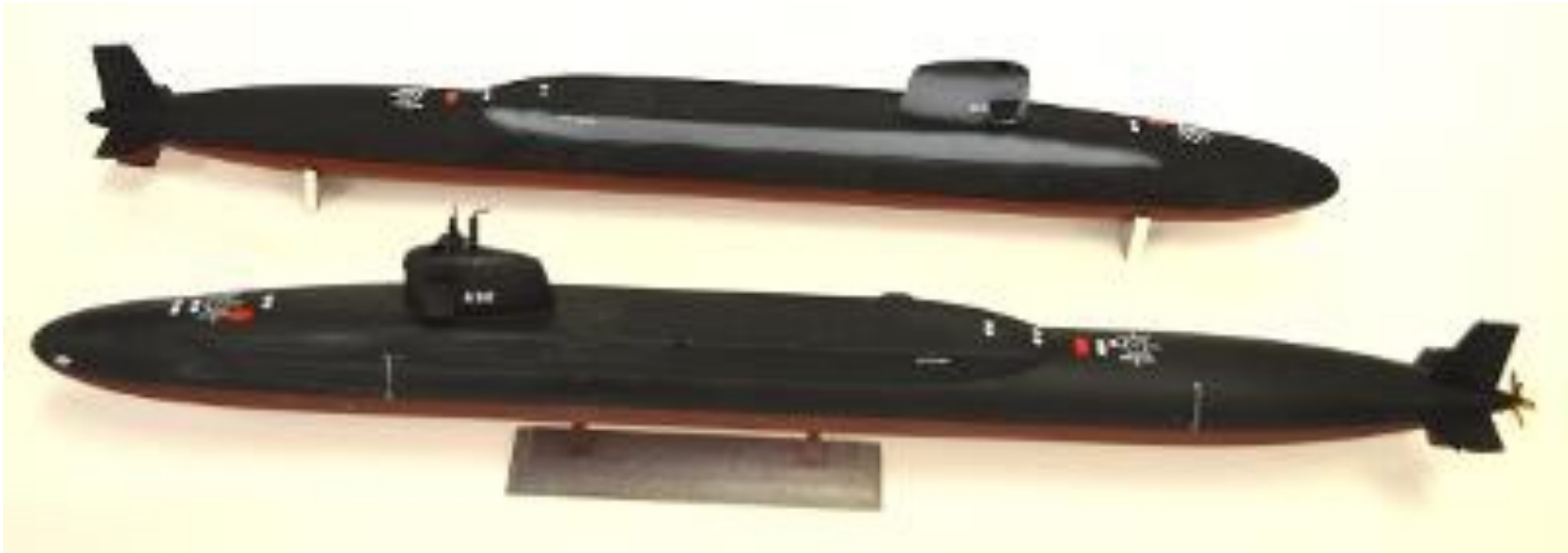
Clifford Bossie's 1/350 th Scale Submarines

you cannot or do not want to show on either date, that is your choice to make. I will only take enough tables for those that wish to display.