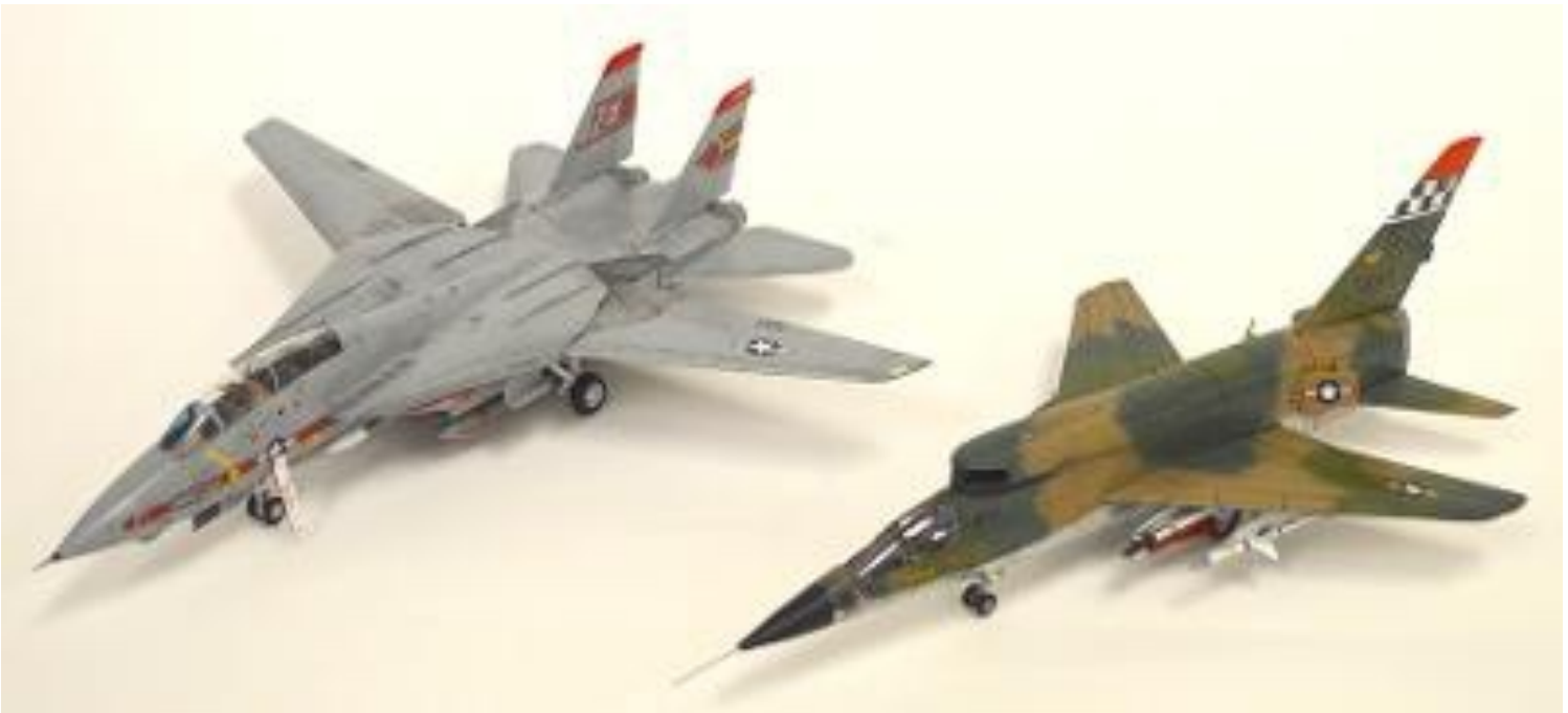
Phoenix Villa's F-14 and F-107 in 1/72 nd Scale

The F-100C was built from the Trumpeter kit and the Italeri kit was used for the F-100A , a conversion, of course.