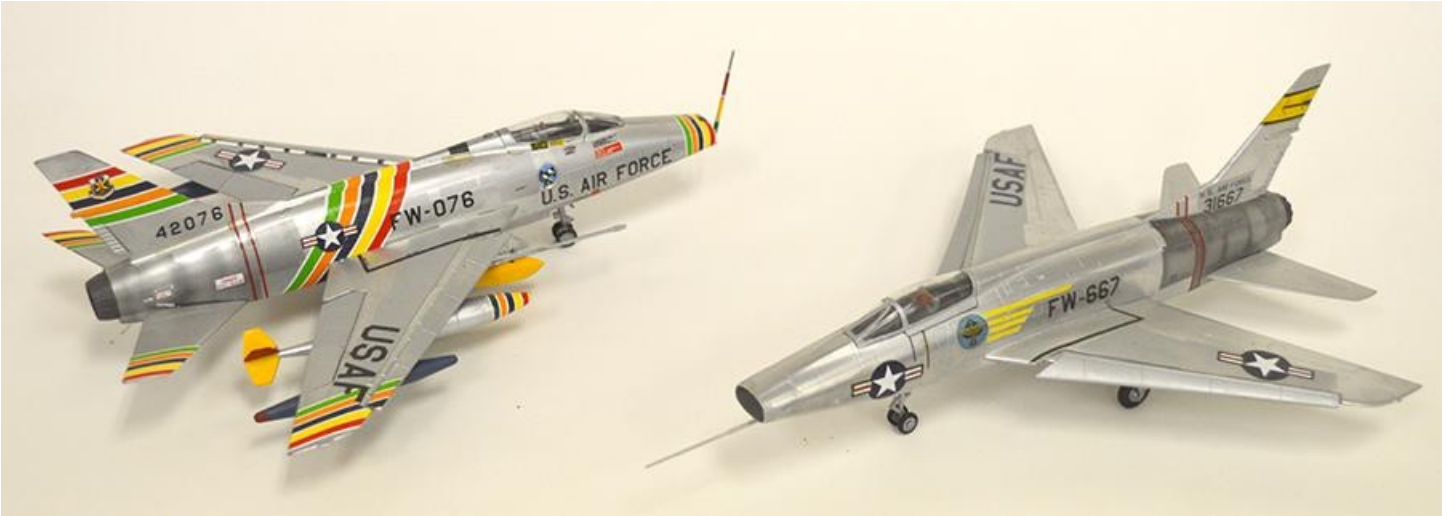
Clifford Bossie's F-100 Super Sabers in 1/72 nd scale

The F-100C was built from the Trumpeter kit and the Italeri kit was used for the F-100A , a conversion, of course.