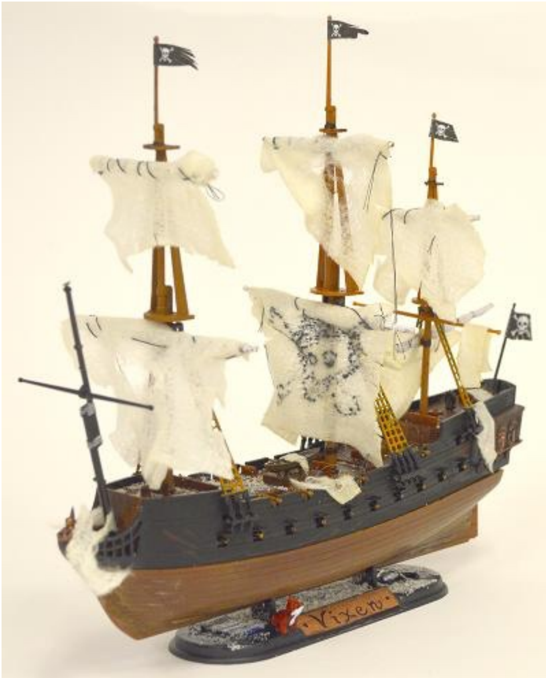
Dixi Fischer's Pirate Ship WIP

This will be part of Dixi's Halloween display. The scale is 1/350 th and it has been weathered for Ghosts.