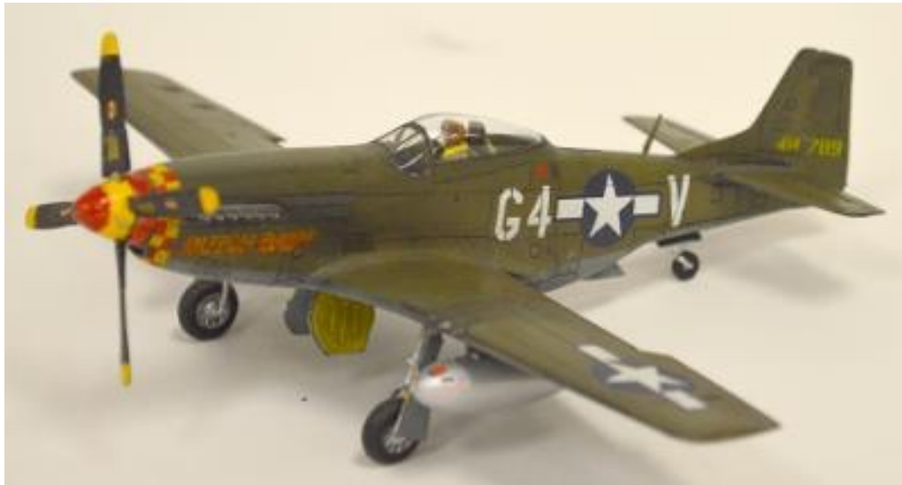
Phoenix Villa's P-51 D

All of Phoenix Villa's models were in 1/72 nd scale. The P-51D was built from the Airfix kit. The F-14 was an Academy kit. His F-104 was a Hasegawa, as was the F9F Panther. The Draken was built from the Revell kit and his F-5, was done in aggressor markings. The X-01 was a Power Armor piece. Photo is on page 9.