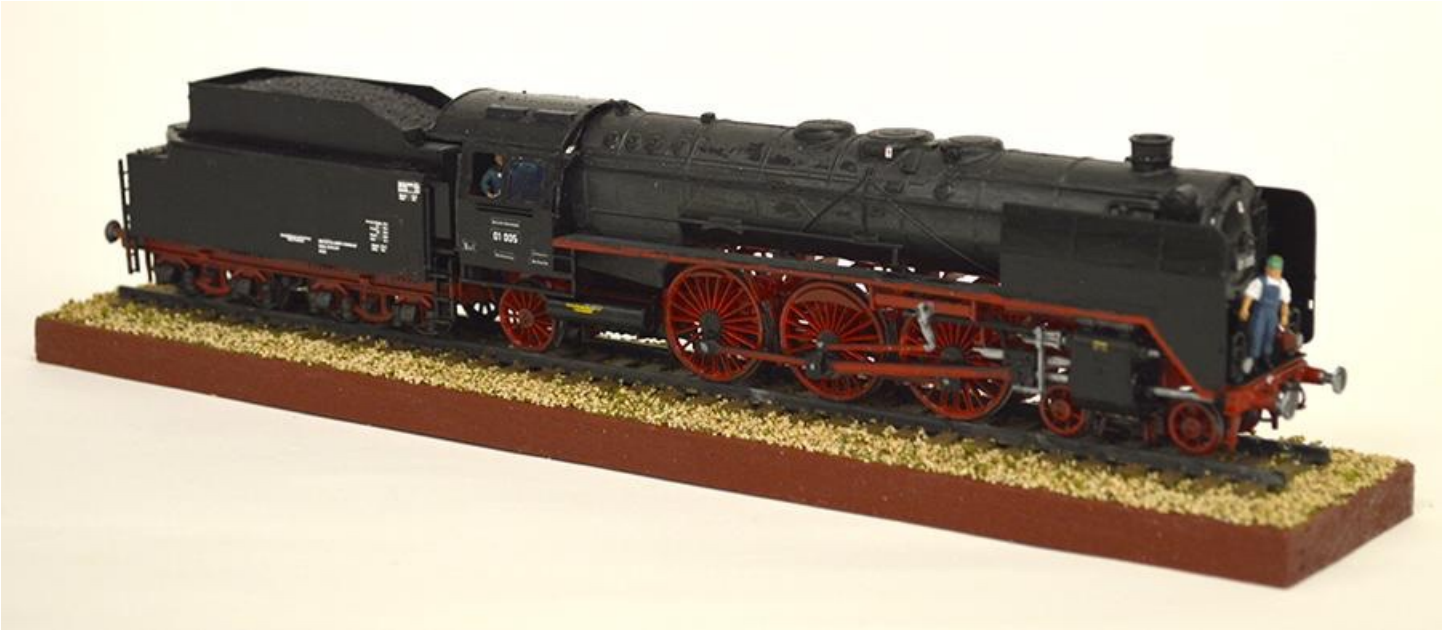
Art Berdick's 1/87 th scale Schnellzuglokomotive BR 01 and Tender built from the Revell kit.