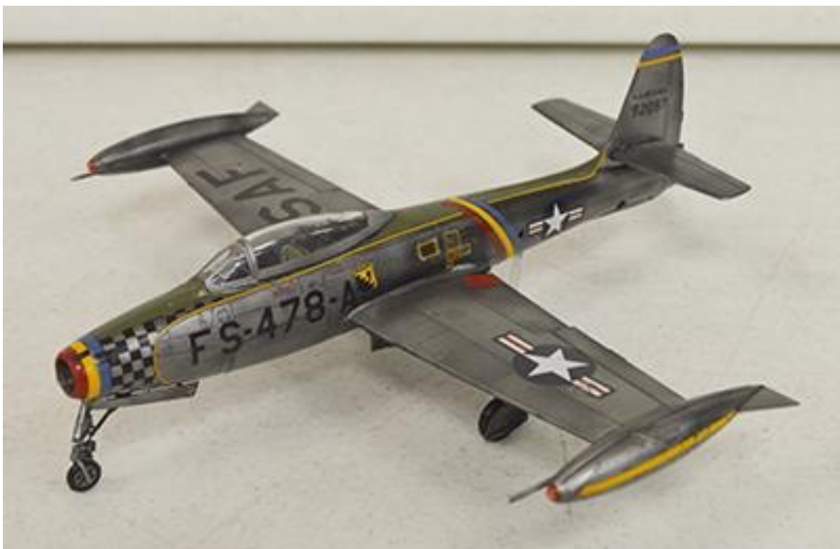
Carlos Delgado's F-84

The A-26 is in 1/72 nd scale built from a Revell kit. The Me110 is a 1/48 th scale model built from the Fujimi kit. The F-84 is a Revell kit in 1/48 th scale.