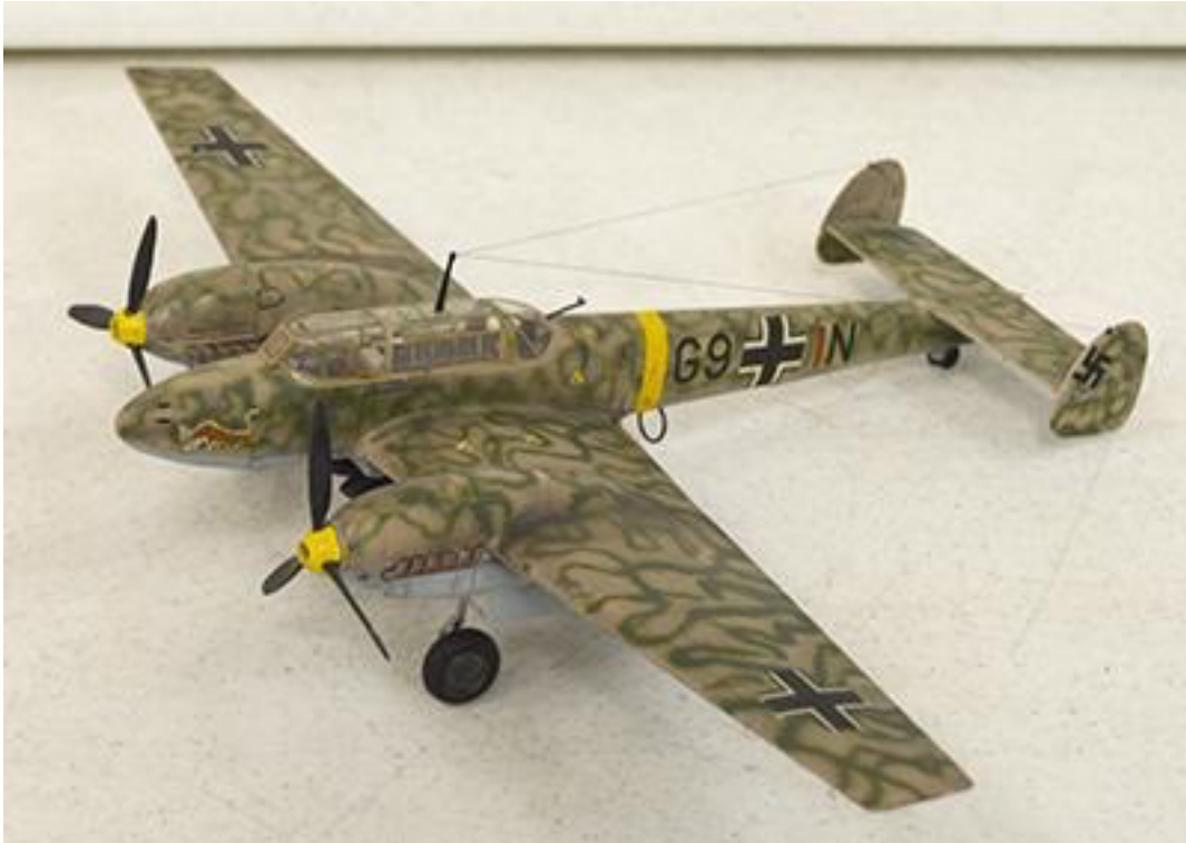
Carlos Delgado's Me 110