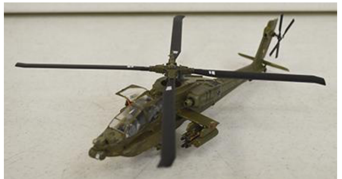
and his AH-64A Apache

All are in 1/72 nd scale except for the EC-121 which is 1/144 th scale.