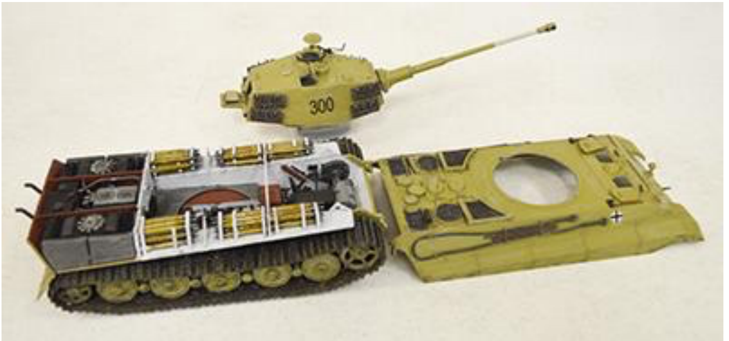
Art Berdick's King Tiger in 1/35 th scale