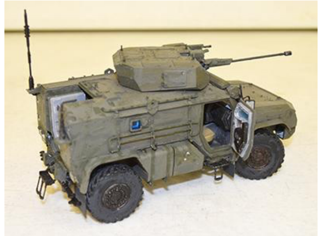
Meng 1/35th scale Russian K4386 Typhoon-VDV built by Arthur Berdick