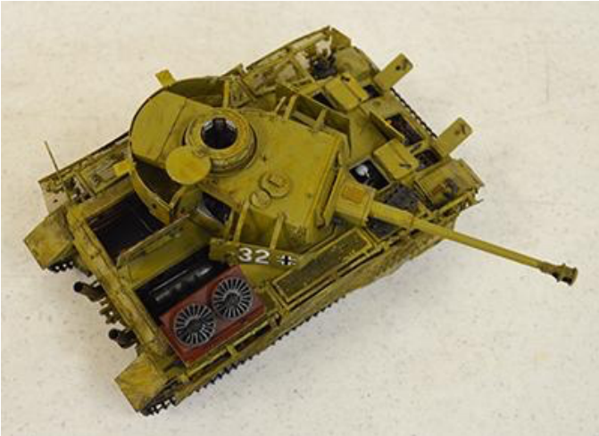
Ryefield Models 1/35 Pz.Kpfw.IV Ausf.J Sd.Kfz 161/ built by Arthur Berdick