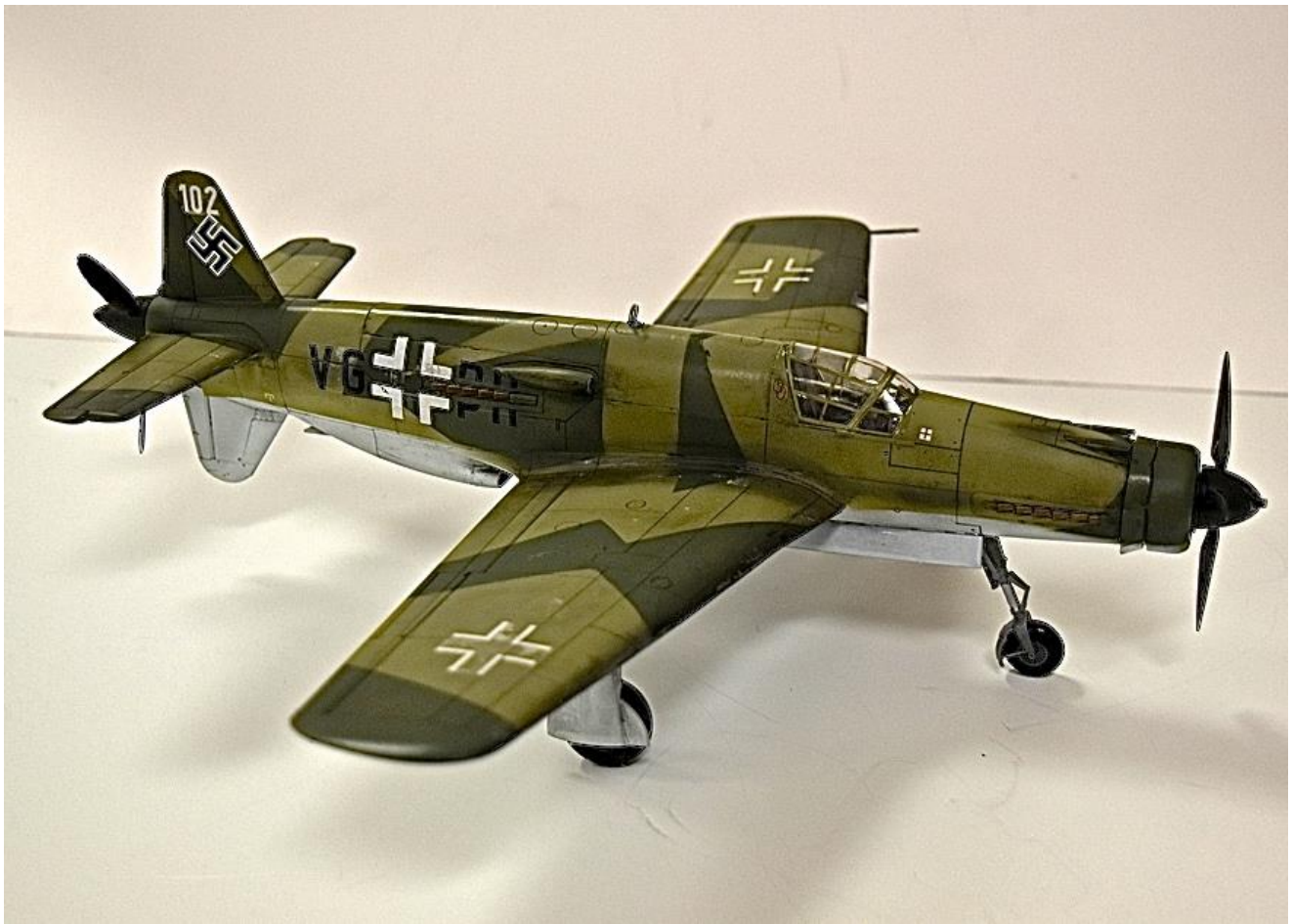
Carlos Delgado's 1/48 th Do 335 in 1/48 th scale.