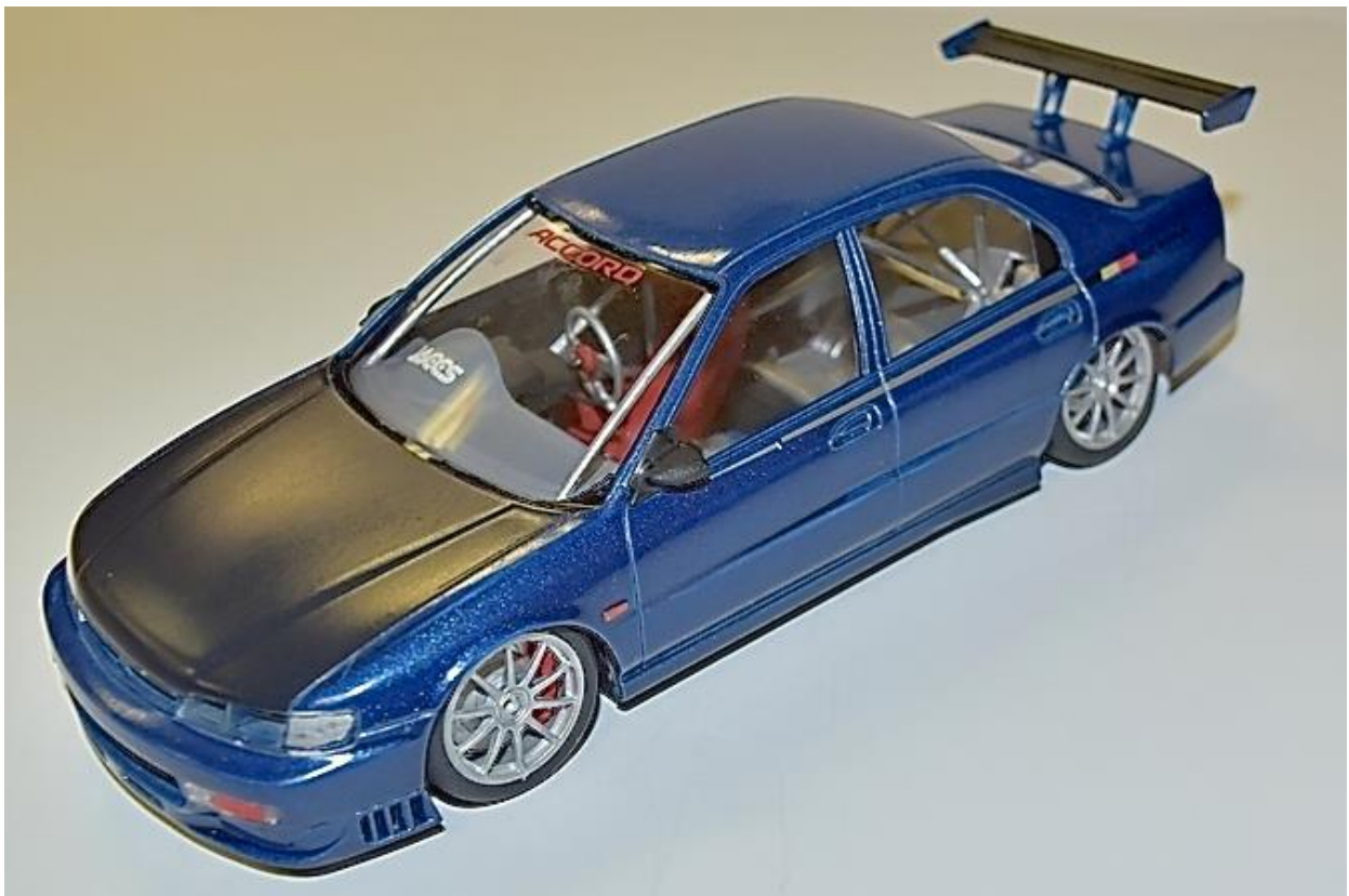
Sergio Morales's 1/25 th scale Accord