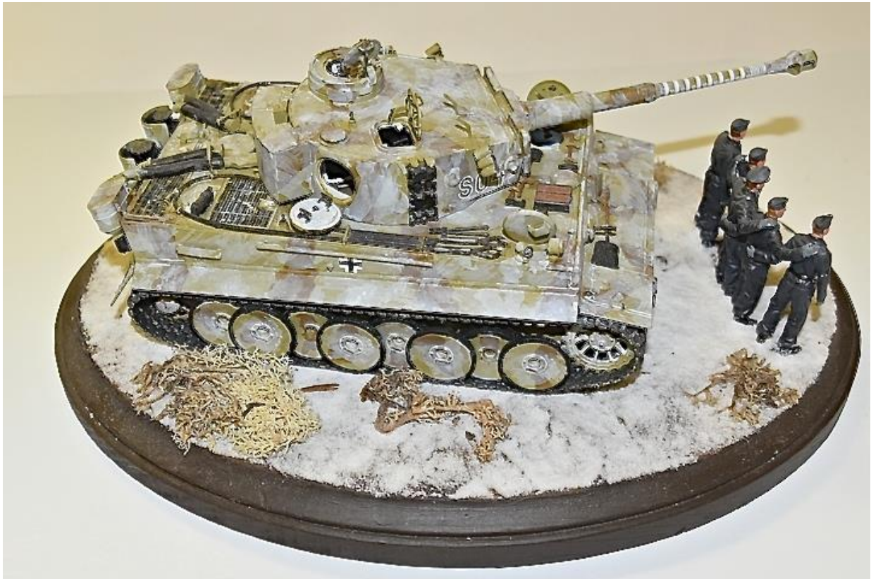
Arthur Berdick's 1/35 th scale Tiger I