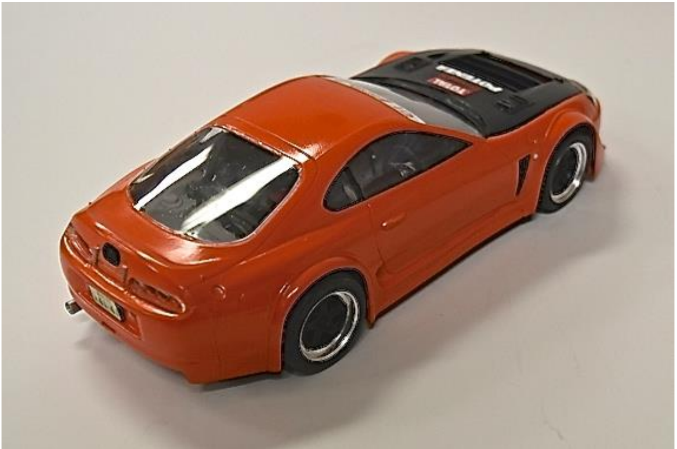
Sergio Morales's 300ZX Fairlady Z