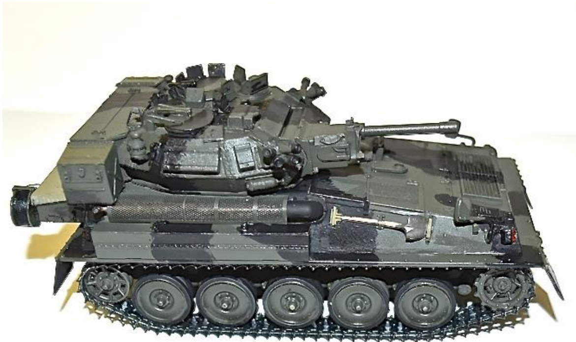
Carl Webster's Scorpion in 1/35 th scale.