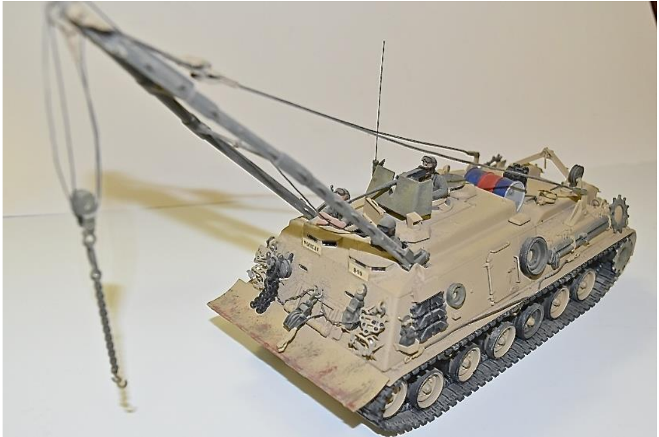
Carl Webster's M88 A1 in 1/35 th scale.