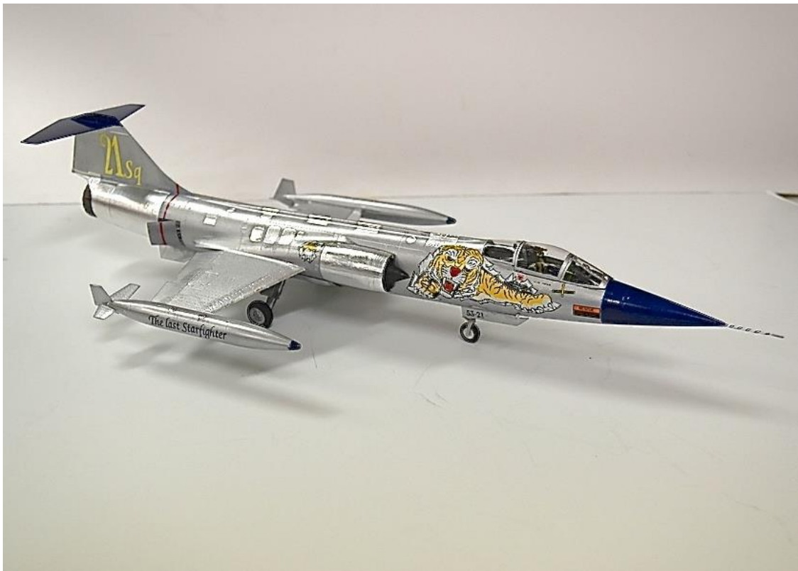
Richard Macias's F-104S in 1/48 th scale. The GLUE July 2017 5