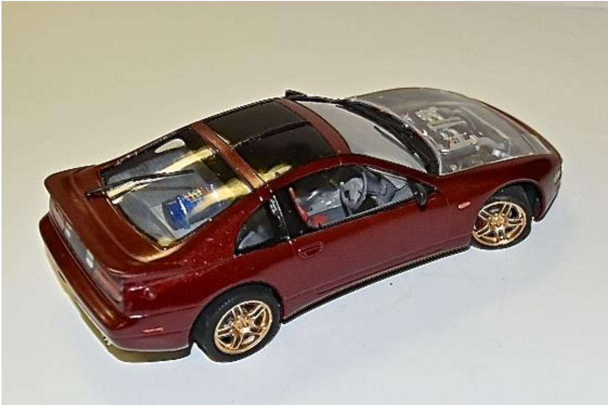
Sergio Morales 3000+ GTO