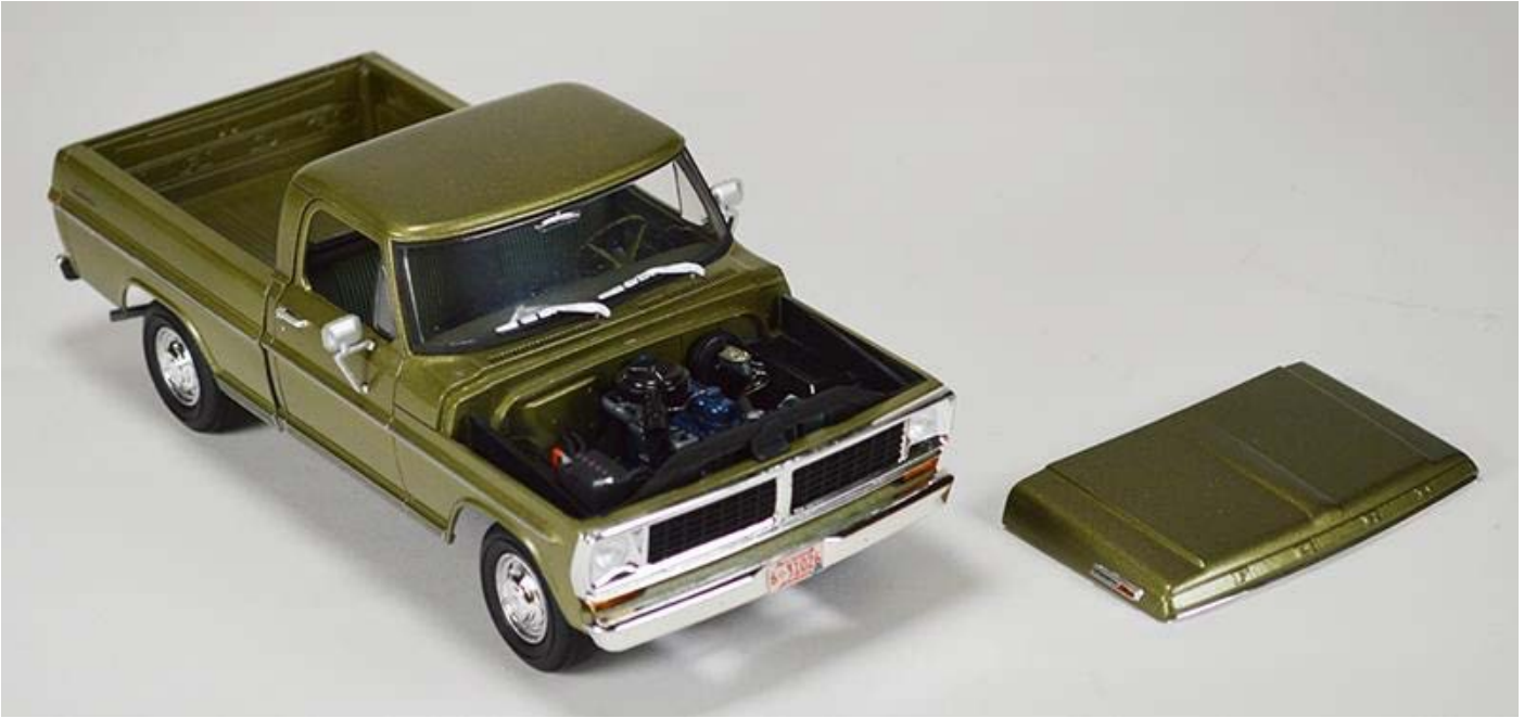
Joe Martinez's 1970 F-100 Custom Sort Bed Ford Pickup

Joe added plug wires and seat belts from Gofer Racing. The New Mexico license plate came from an E Bay Vendor. The Battery clamps and retainers were from Detail Master. Joe fabricated the heater hose, brake lines, and brake booster from various diameters of wire.