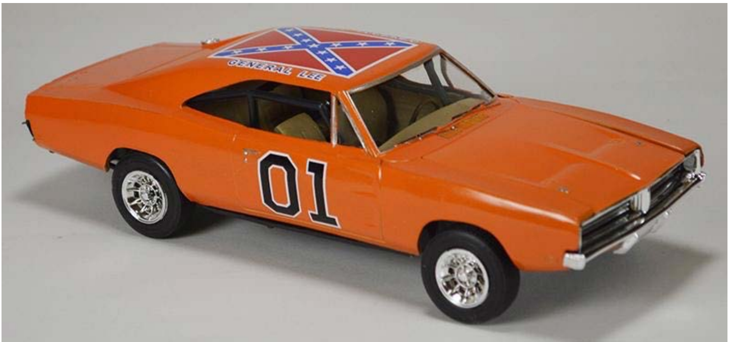
Hector's "General Lee" 1969 Dodge Charger 1/25 th scale MPC kit