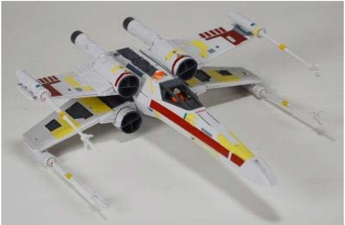
Luke Franco's X Wing Star Fighter