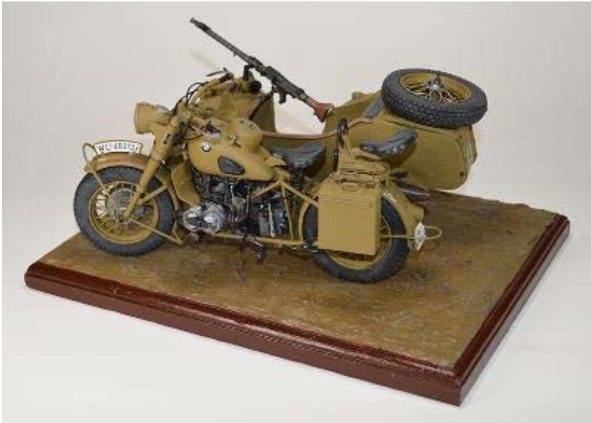
Arthur Berdick's 1/9 th scale BMW Military Motorcycle