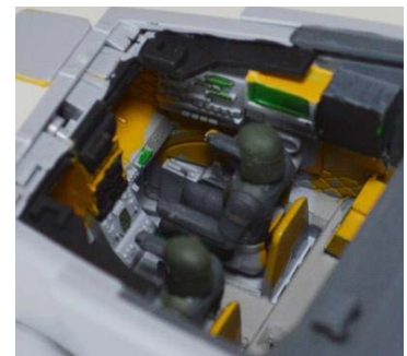
Interior detail of the AT-ST Walker