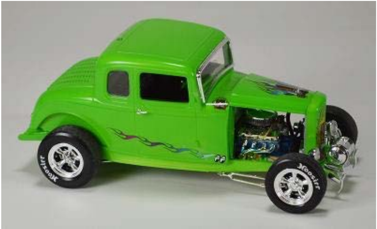
Hector Gonzalez's 1932 Ford 5-Window Coupe 1/25th scale Revell