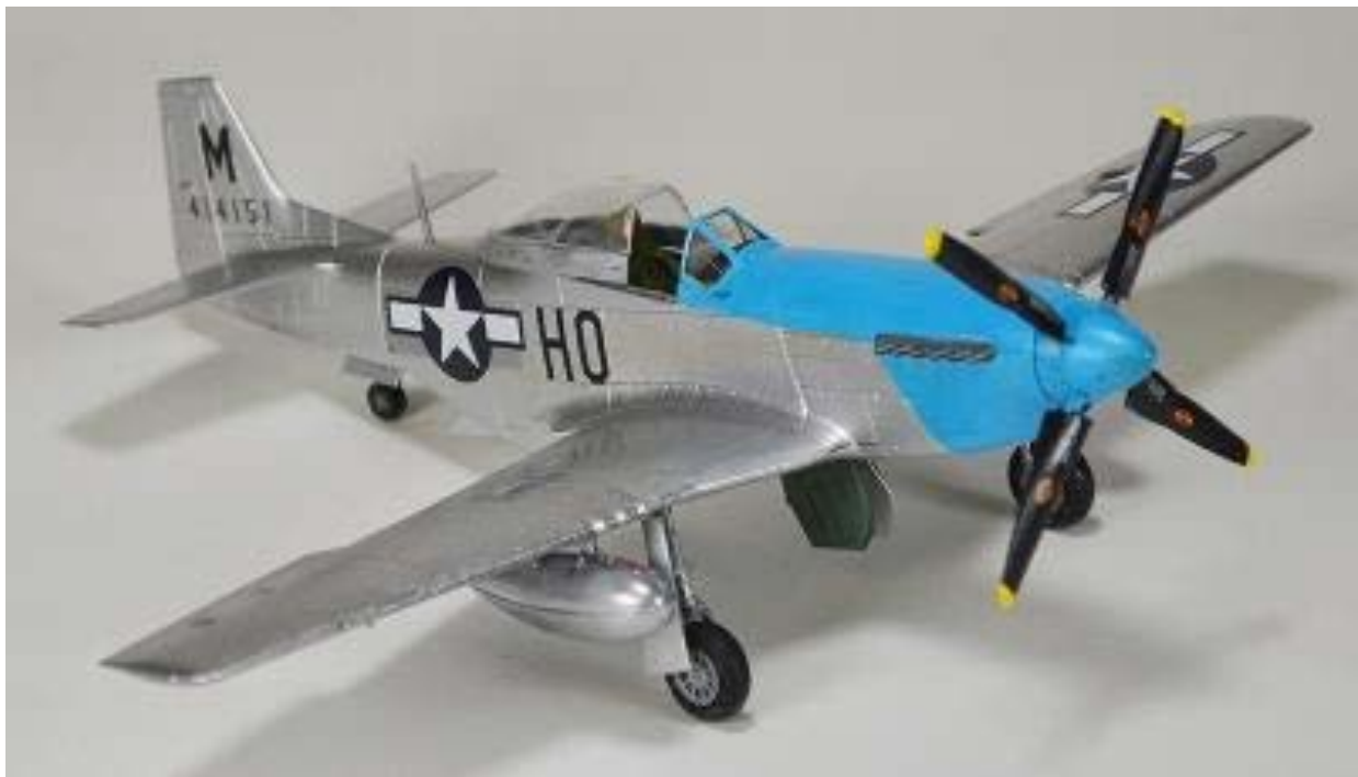
Richard Macias's Tamiya 1/48 th scale P-51D Eighth Air Force

“The 1/32 nd scale is a re-build from a USAF Fighter to a color and schematic change.” The kit is the Revell 1/32 nd scale model.