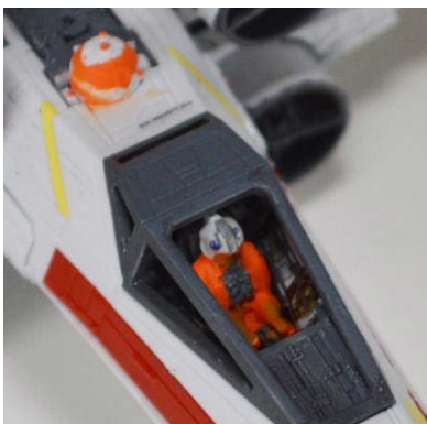
Interior detail of the X Wing