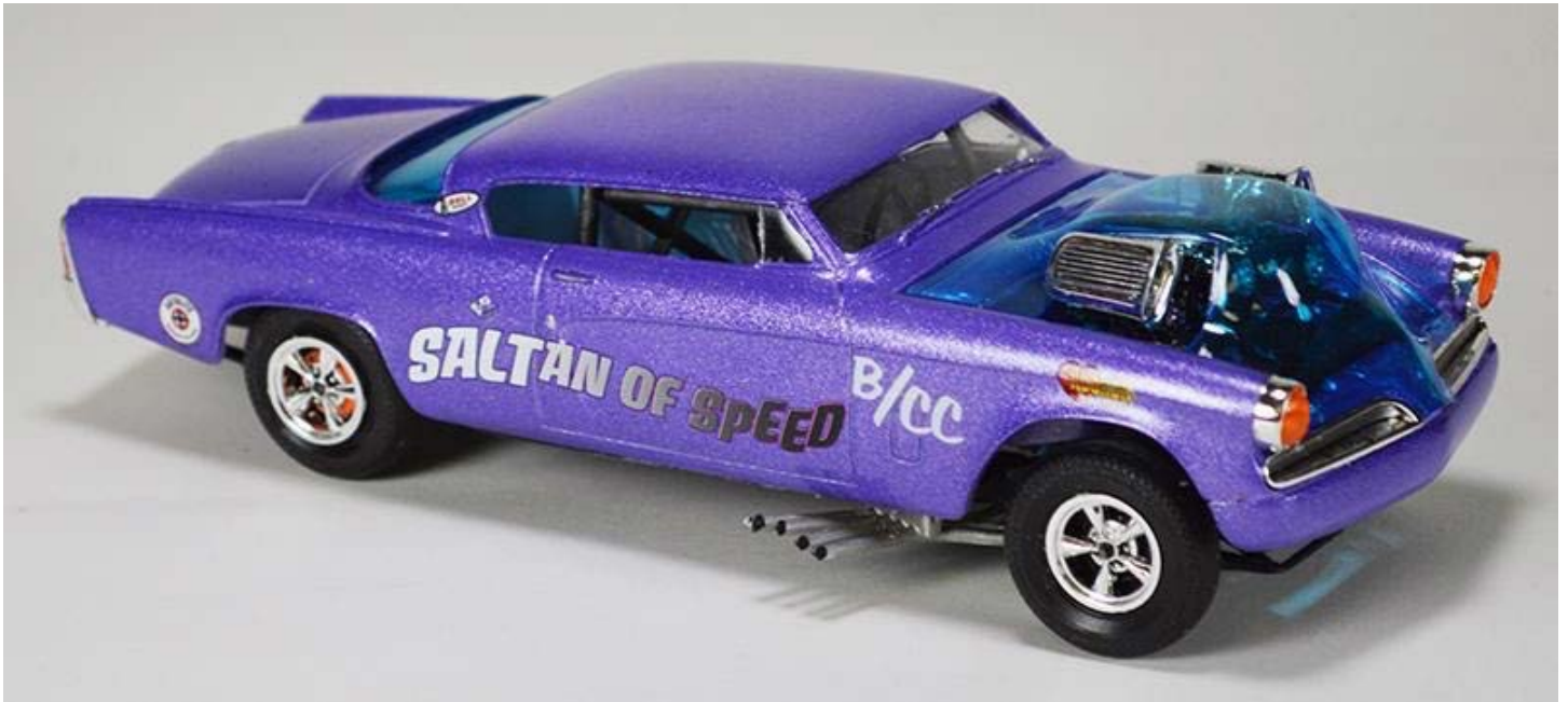
Hector Gonzalez's Studebaker Dragster 1/25 th scale AMT kit