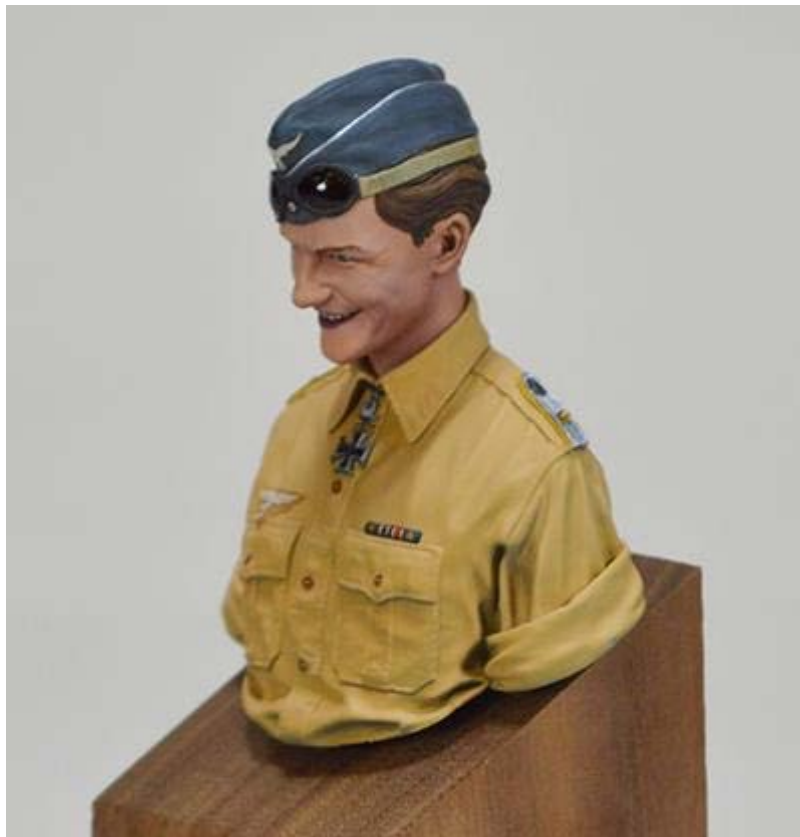
Dolman Minatures 1/10 th scale Hans Joachim Marseille, and Painted in acrylics.

Joe added plug wires and seat belts from Gofer Racing. The New Mexico license plate came from an E Bay Vendor. The Battery clamps and retainers were from Detail Master. Joe fabricated the heater hose, brake lines, and brake booster from various diameters of wire.