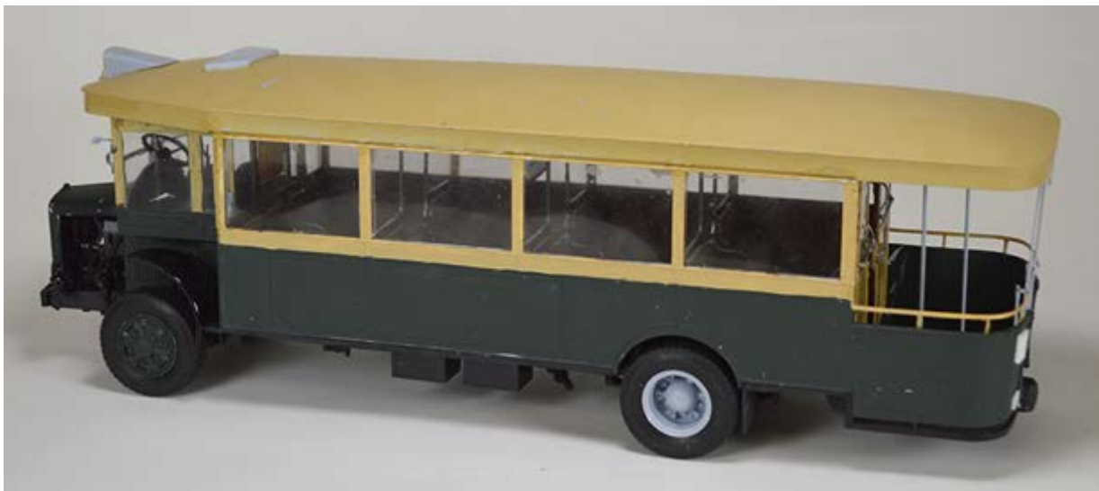
Arthur Berdick's 1/24 th scale Auto Bus WiP