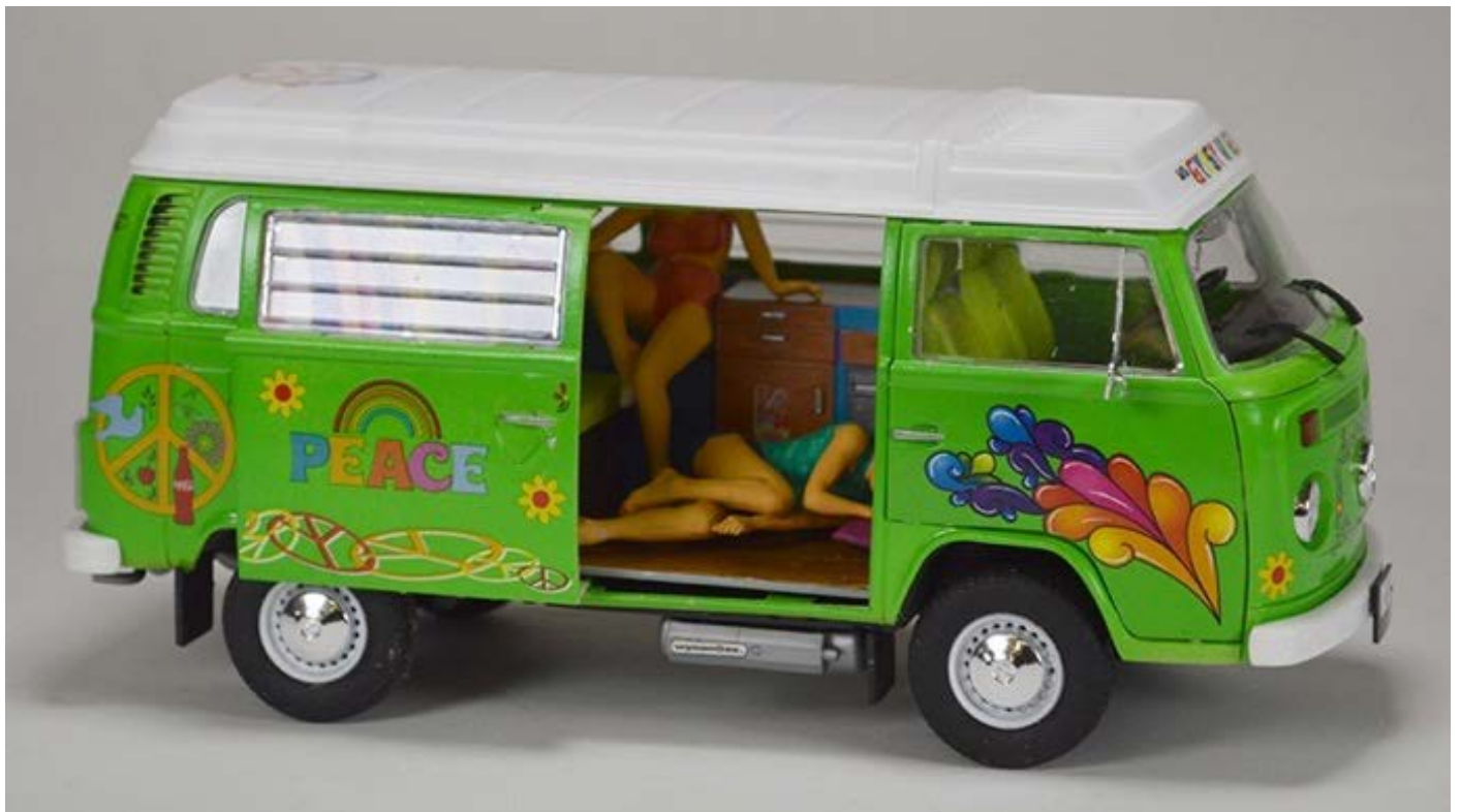
Hector Gonzalez's Revell 1972 VW Bus "Hippy"