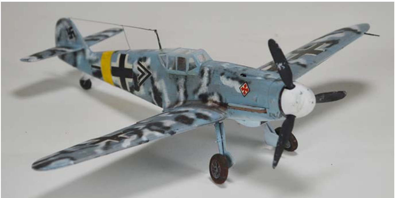
Carlos Delgado's Me109 in 1/48 th scale