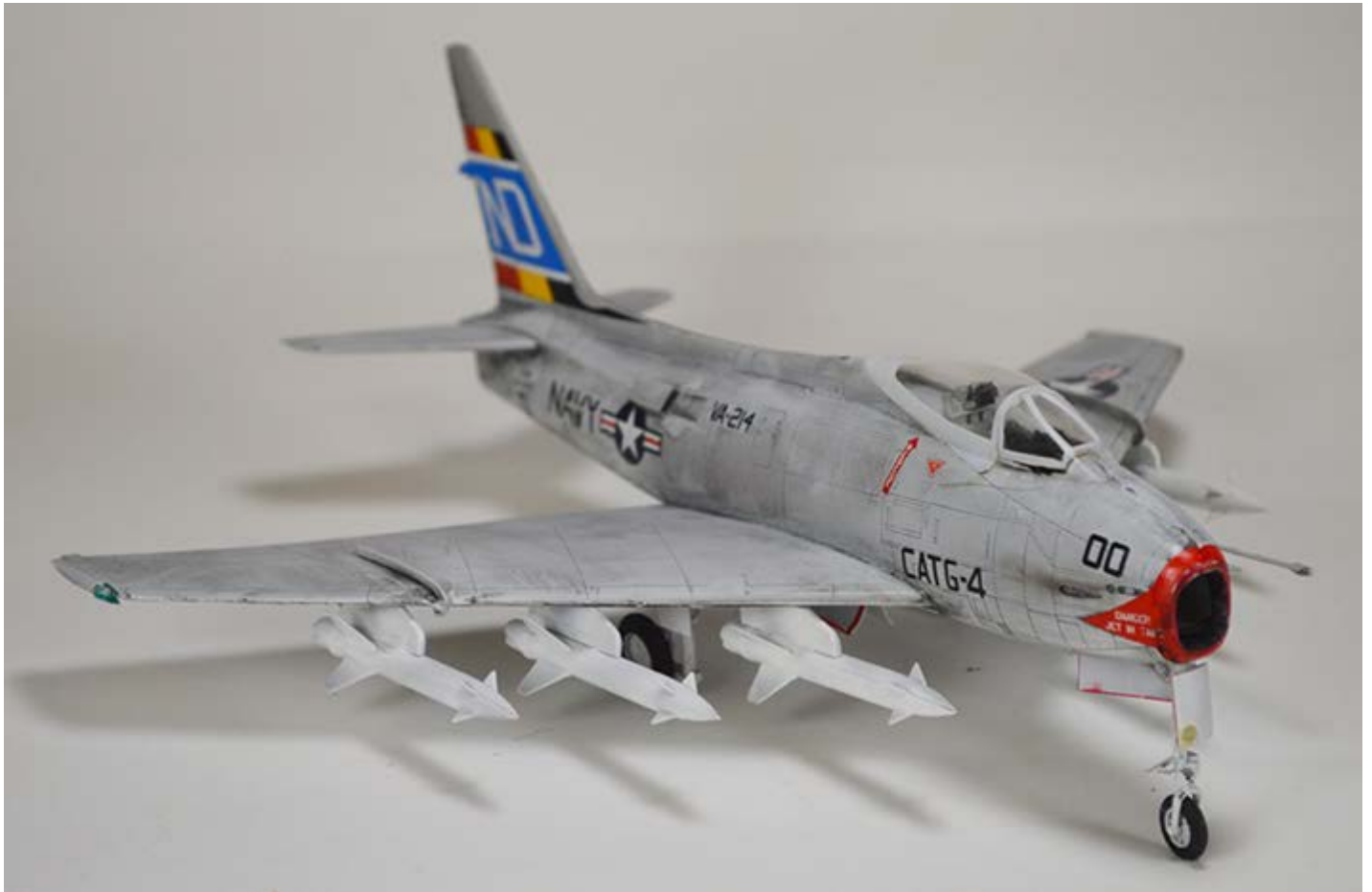
Carlos Delgado's F4J-4 in 1/48 th scale