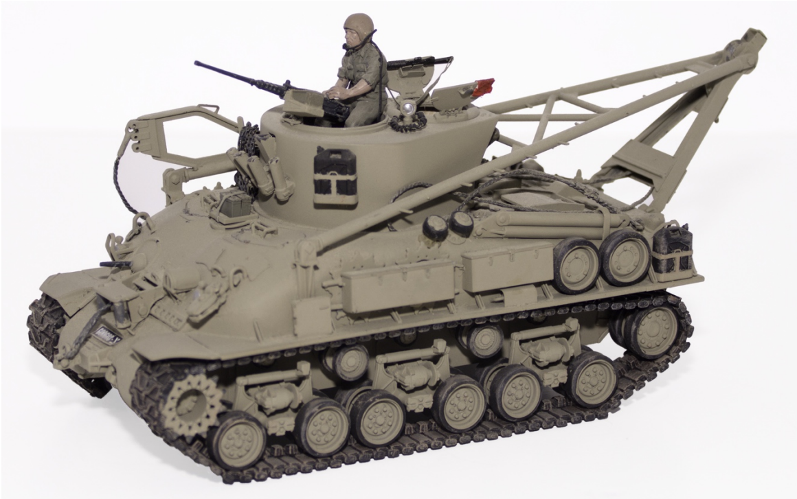
Carl Webster's Sherman