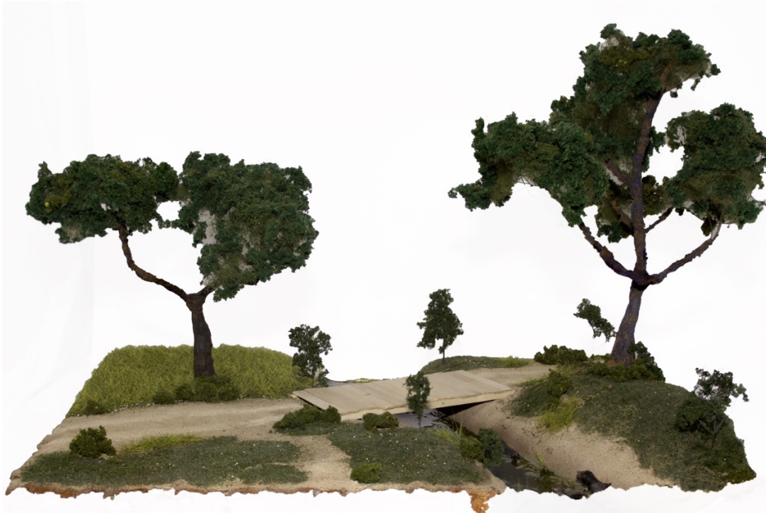
Sal Samaneigo's Work in Progress, a 1/35 th scale diorama