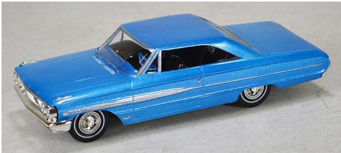
Hector Gonzalez's 64 Ford Galaxie