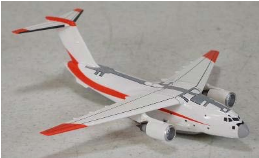
No info but maybe Kai Garcia WIP