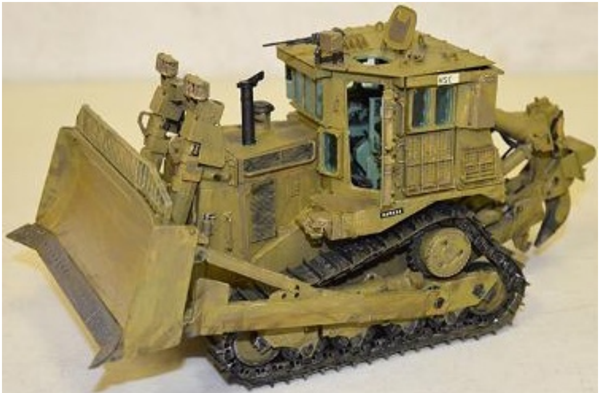
Art Berdick's Armored Bulldozer in 1/35 th scale