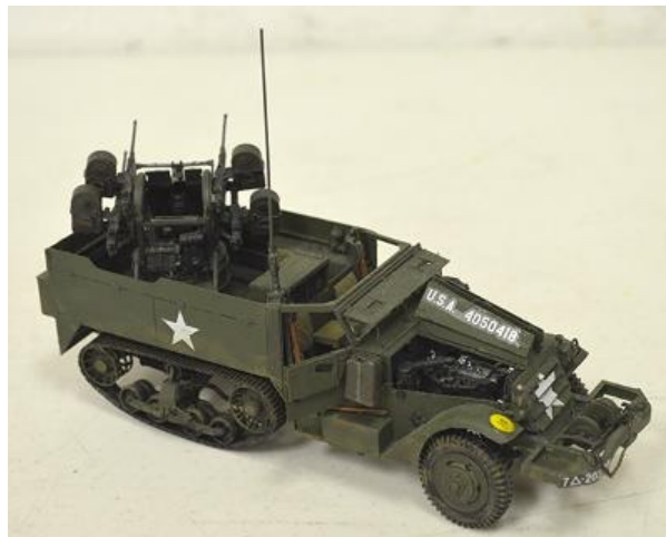
All three models by Art Berdick M-16 Halftrack