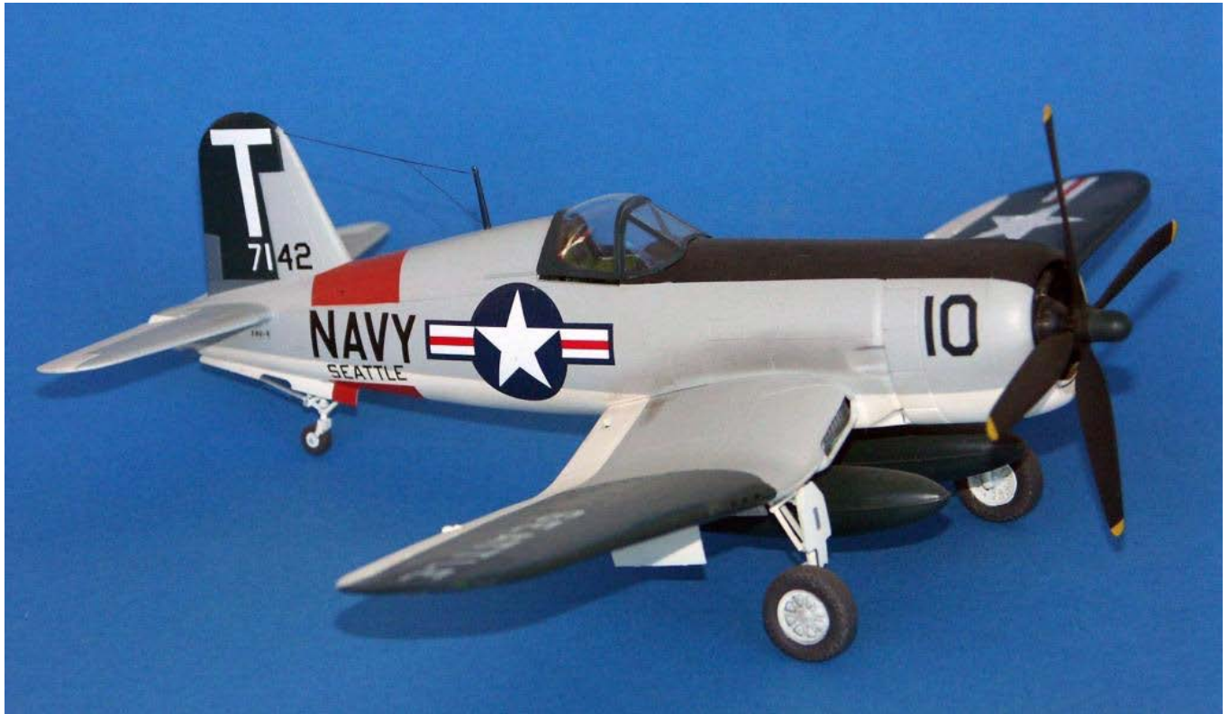
Jack Callaway's F4U-4 in 1/48 th scale