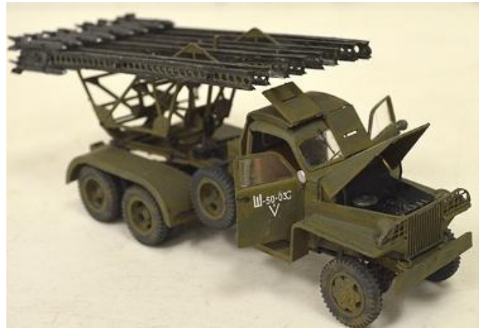
Russian Katyusha Rocket System