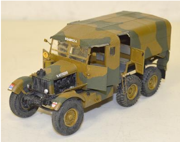
Scammell Artillery Prime Mover