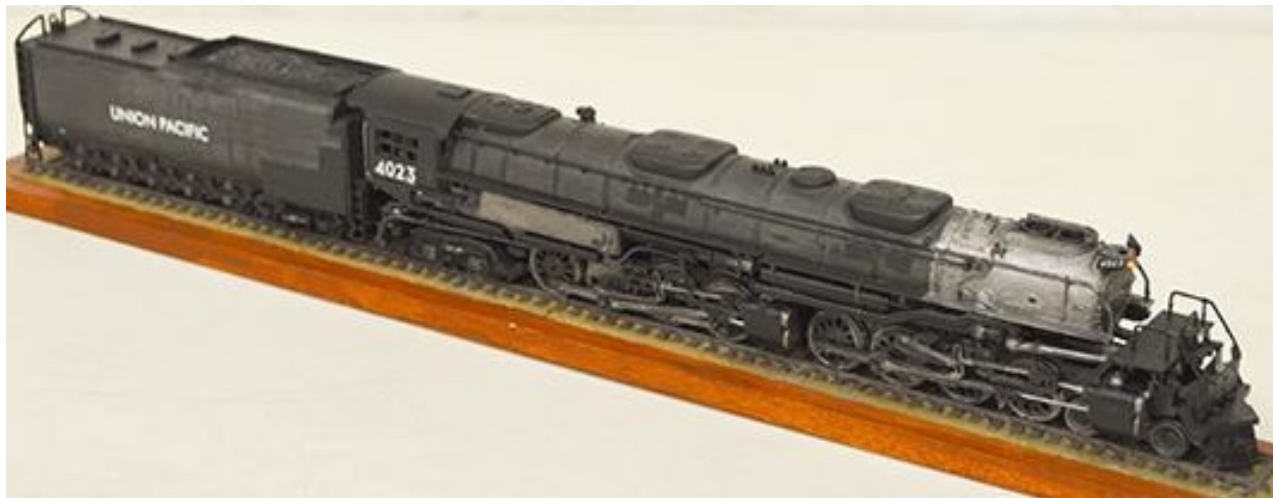
Art Berdick's Big Boy locomotive in 1/87 th scale