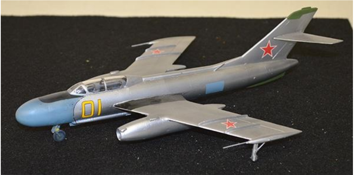
Duane Velasquez's Yak 25 in 72 nd scale