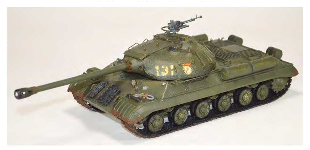
Gerasimos Grigoropoulos Trumpetor1/35th scale IS-3