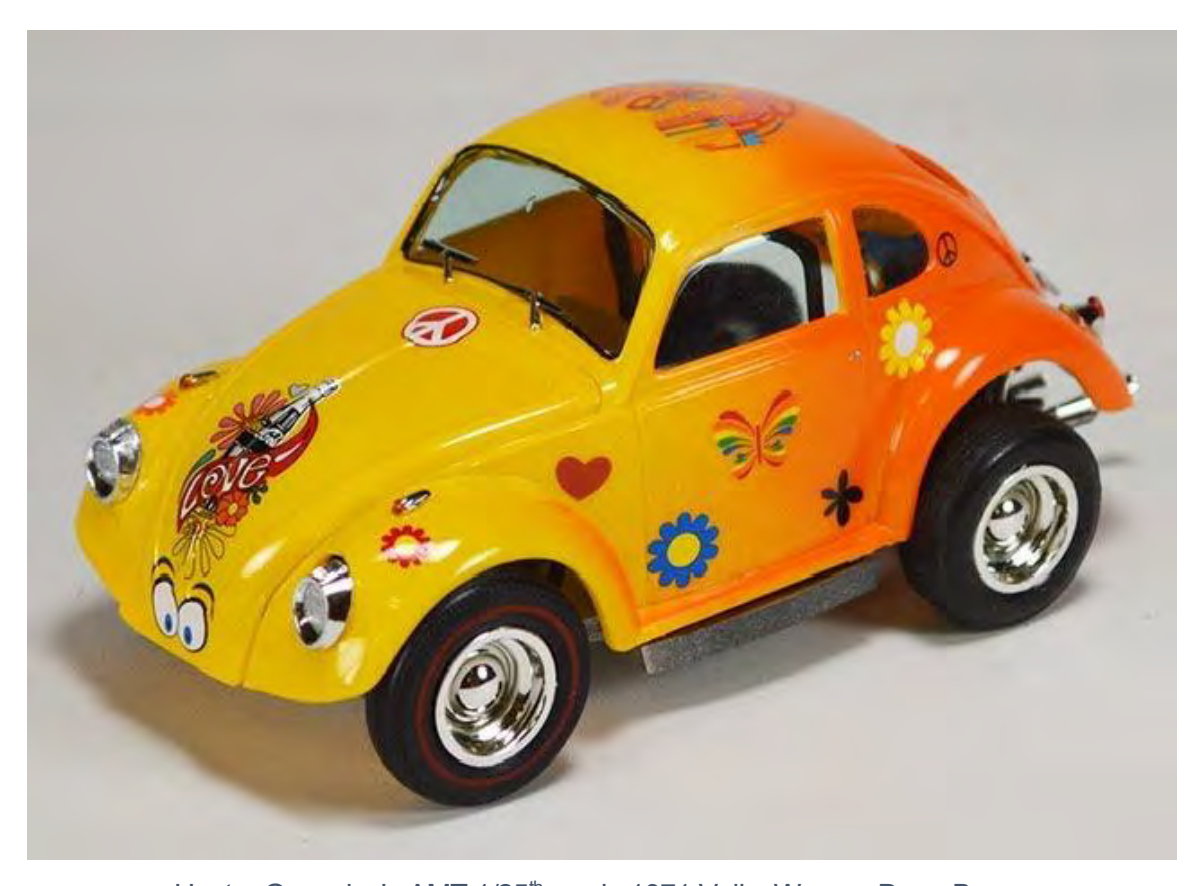
Hector Gonzalez's AMT 1/25<sup>th</sup> scale 1971 Volks Wagon Dune Buggy

The following items were 3-D printed: Tires and rims, carburetor and water pump, Shifter cable, the seat belts, the fuel lines and "T" fuel connector, the distributor and the racing headers.