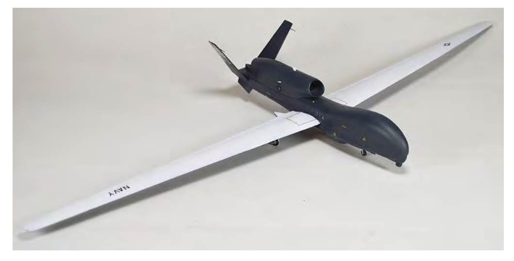
Zahir Vera's Plalz1/72ns scale PQ-4N Global Hawk Drone