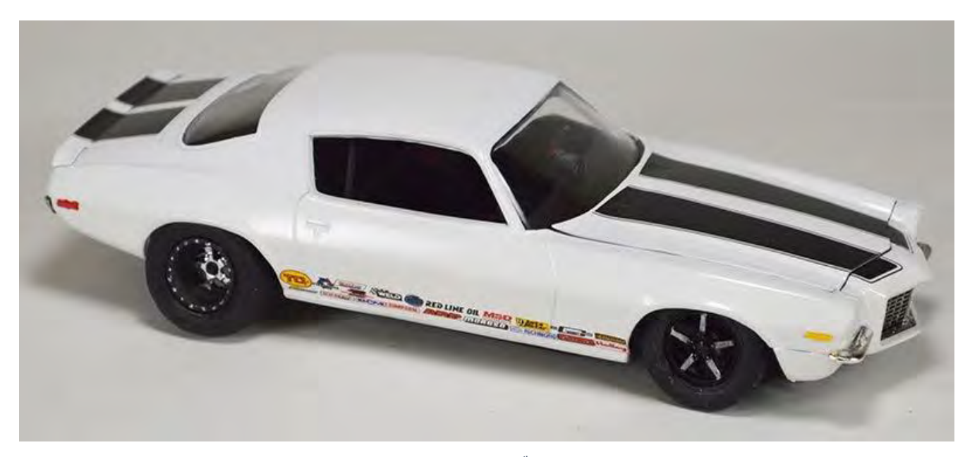
Tony Barnard's 1/25<sup>th</sup> scale 1970 Camero

The following items were 3-D printed: Tires and rims, carburetor and water pump, Shifter cable, the seat belts, the fuel lines and "T" fuel connector, the distributor and the racing headers.