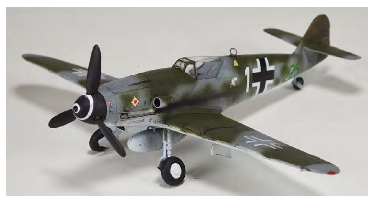
Gerasimos Grigoropoulos Italeri Bf-109 G6

Our next meeting is August 4 at 7000 Edgemere. 2:00 P.M.