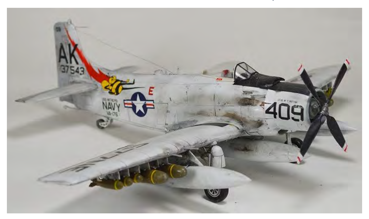
Carlos Delgado's Tamiya 1/48th scale "Skyraider"