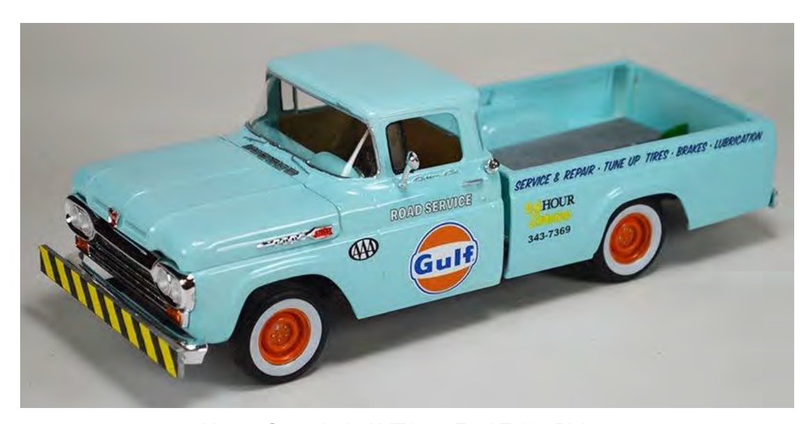
Hector Gonzalez's AMT1960 Ford F-100 Pickup