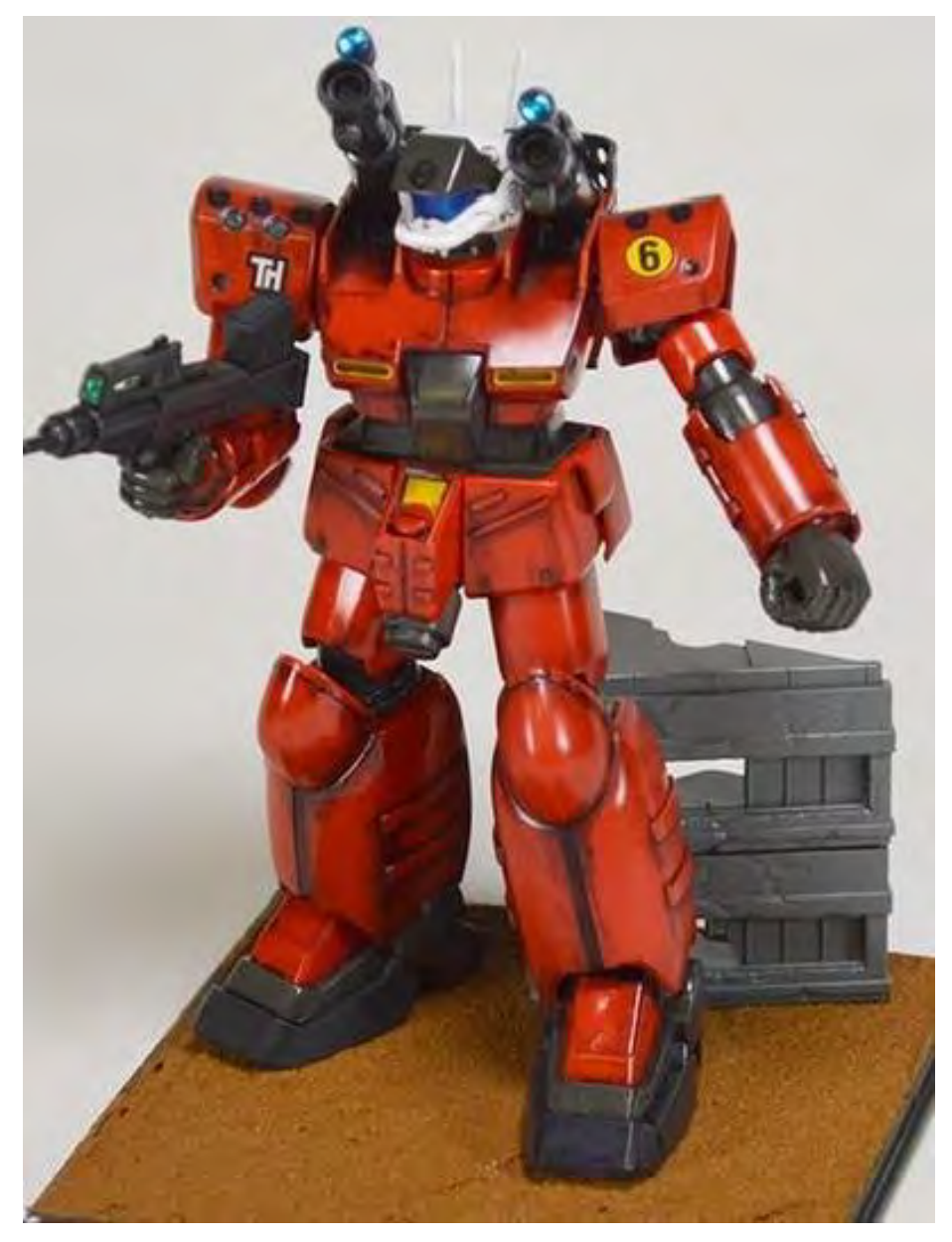
Kyle Smith's Bandi 1/144th scale Guncannon RX-77D

The model was not painted but sanded and polished with rubbing compound. Kyle used Mr. Color water-based markers for detailing and weathering The Blue Optics on the tips of the cannons are jewelry stickers borrowed from his daughter's junk drawer.