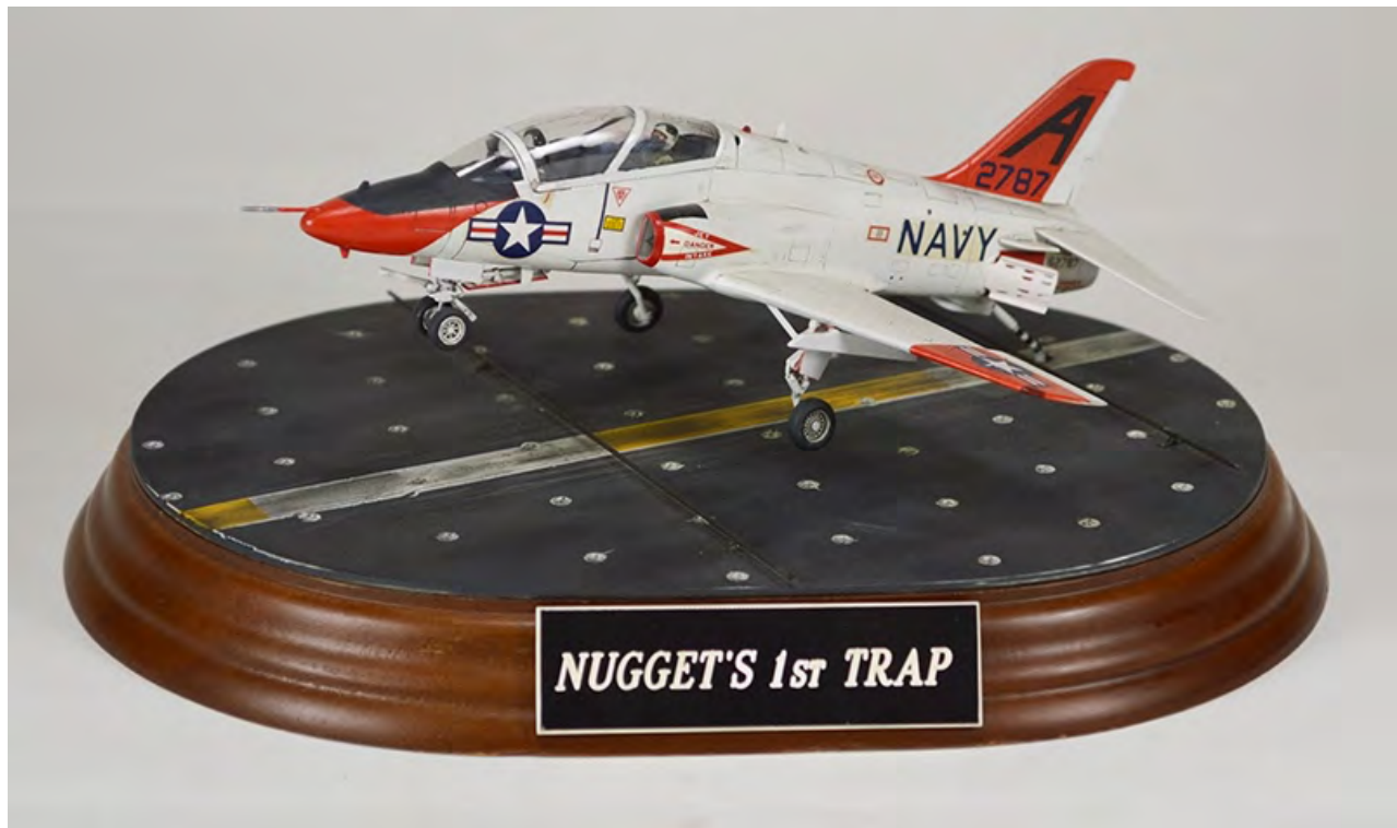
Clif Bailey's Italeri 1/72 nd scale -45 Goshawk