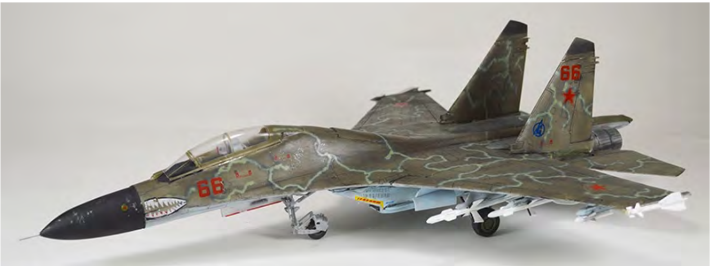
Carlos Delgado's Su 27 in 1/48 th scale. Kit: Zhengdefu

The logo was a hand drawn tube of model cement with the cement running out of the nozzle.