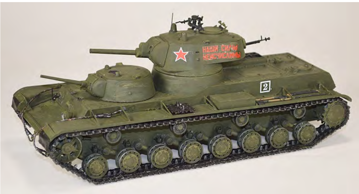
Arthur Berdick's Takom 1/35 th scale Soviet Heavy tank SMK 1939