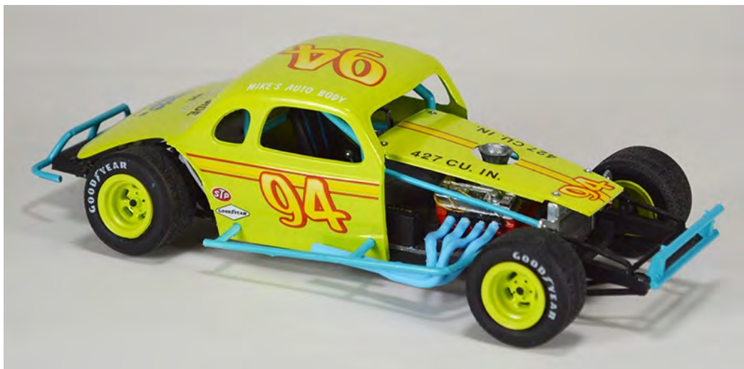
Hector Gonzalez's 1/25 th scale AMT 1935 Modified Chevy Coupe