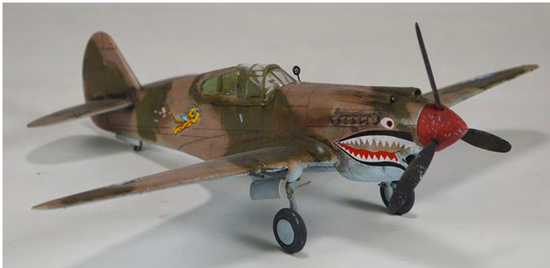
Carlos Delgado's HobbyBoss P-40 in 1/48 th scale