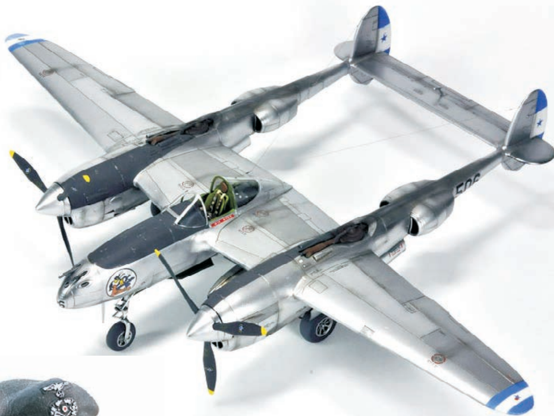
Fabian Nevez's P-38J in 1/48th scale