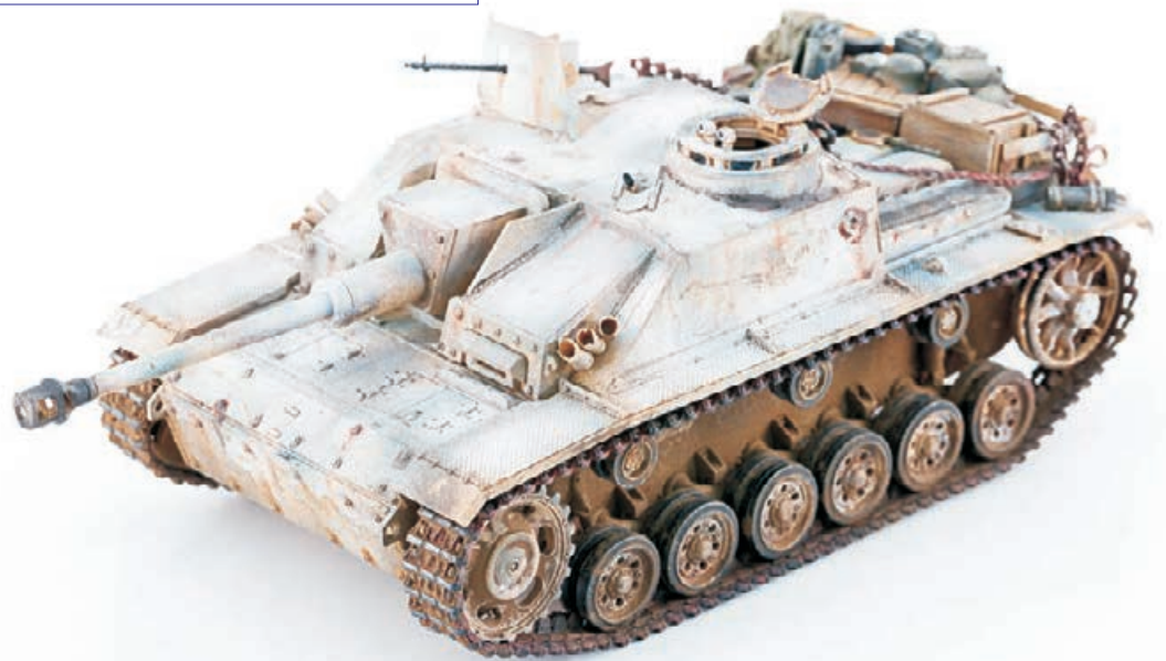
Wayne Williamson's Stug III in 1/35th scale