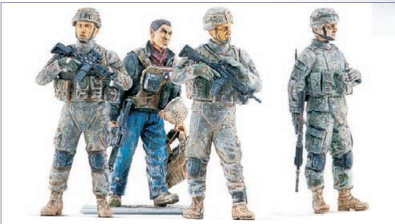
Wayne Williamson's US Forces/Diplomat Surge figures in 1/35th scale