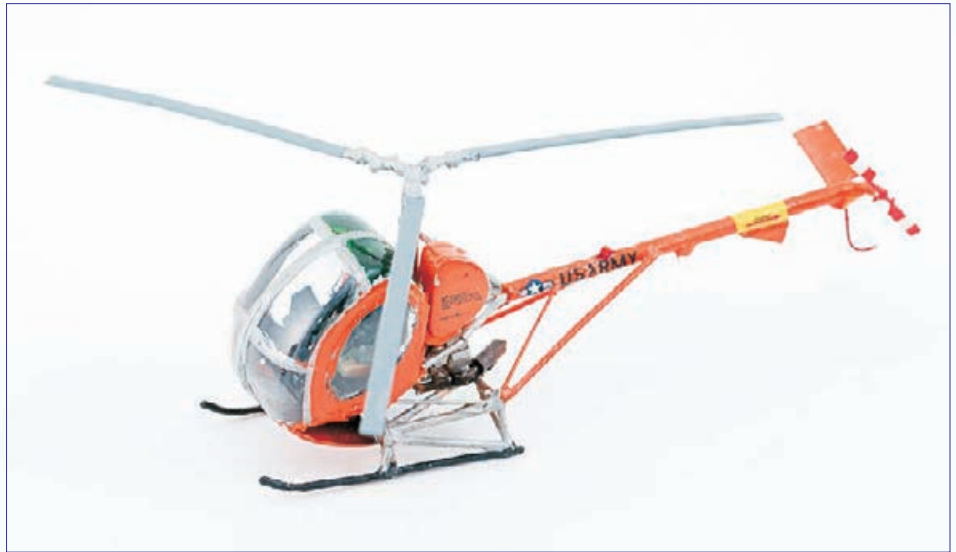
Duane Velasquez's TH-55 in 1/72nd scale