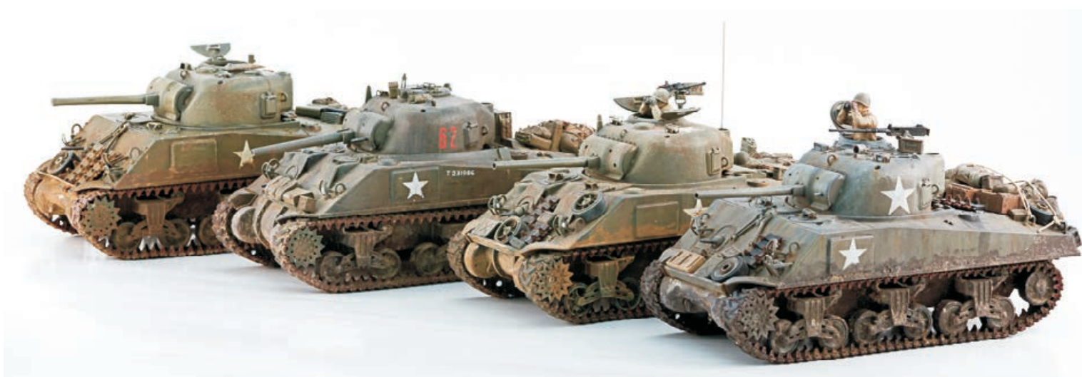
Wayne Williamson's amazing line up of Sherman tanks in 1/35th scale