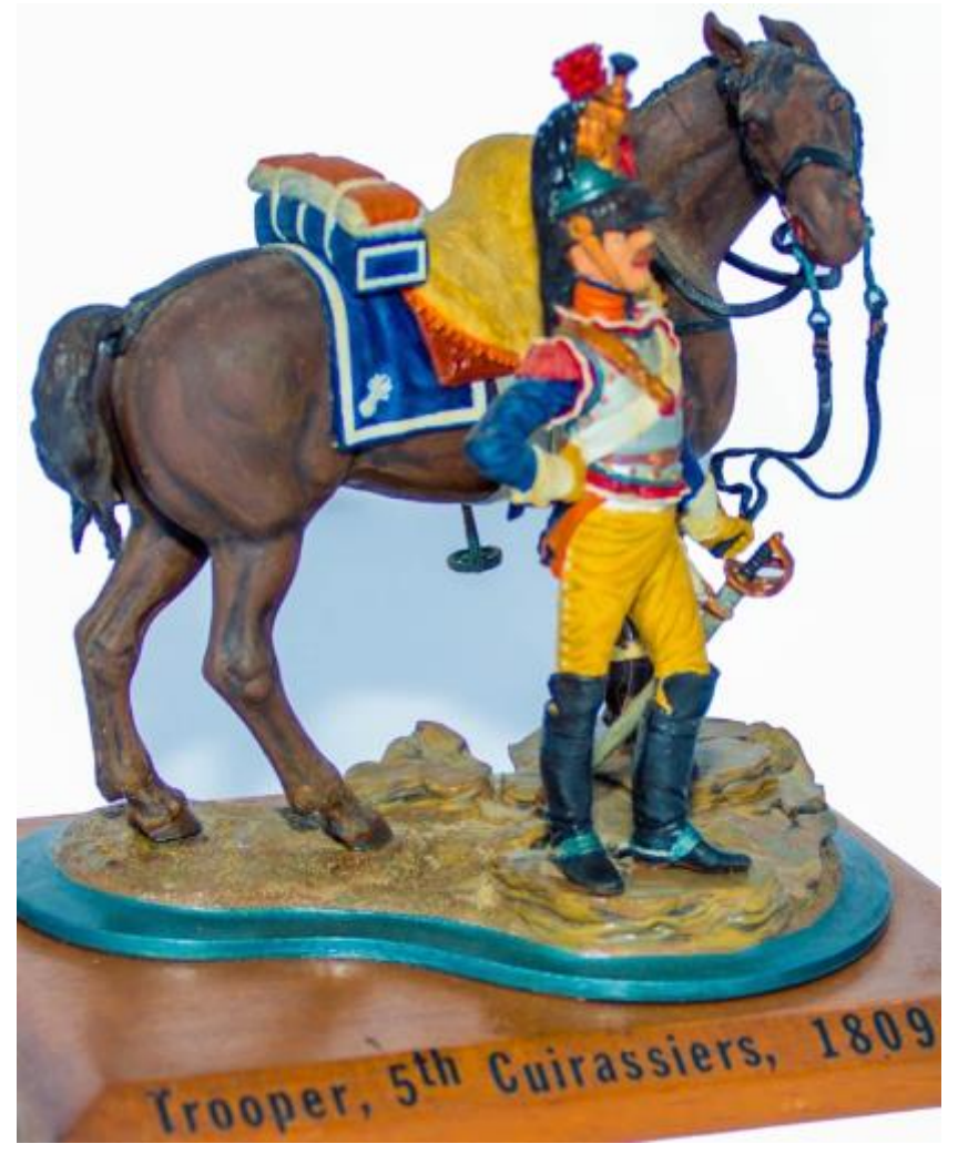
Image 8: Arthur F. Berdick's Trooper of the 5th Cuirassiers, circa 1809