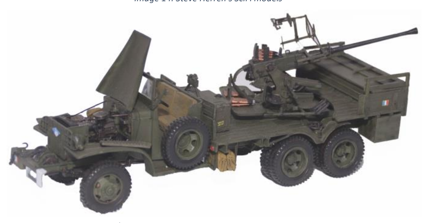
Image 15: 1/35th scale 40 mm Bofors on a GMC Chassis by Arthur Berdick