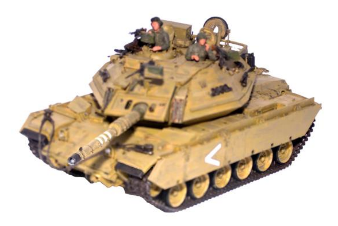
Image 12: Arthur Berdick's 1/35th scale Centurian Sho't Meteor Kal