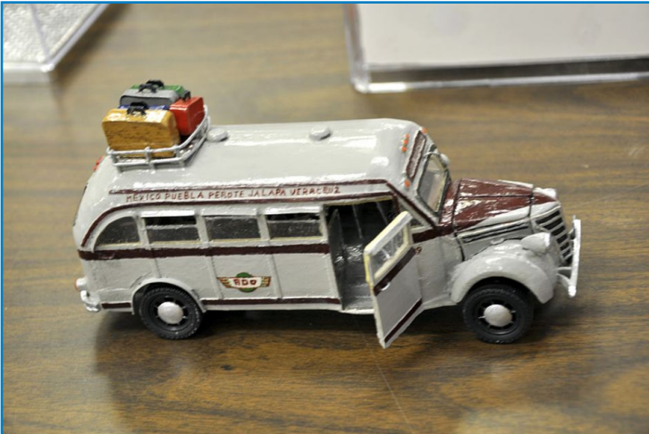
Jose C. Diaz's scratchbuilt 1939 International Bus in 1/32nd scale