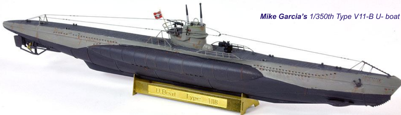
Mike Garcia's 1/350th Type V11-B U- boat

the past week. He also had an Italeri Do 217N Night fighter as a work in progress. To follow up on a discussion on free hand camouflage in 1/72 scale, he brought a Hasegawa Mitsubishi F-1 and a T-2 in the aggressor paint scheme. His last model for this discussion was an F-4 Wild Weasel built from the ESCI kit.