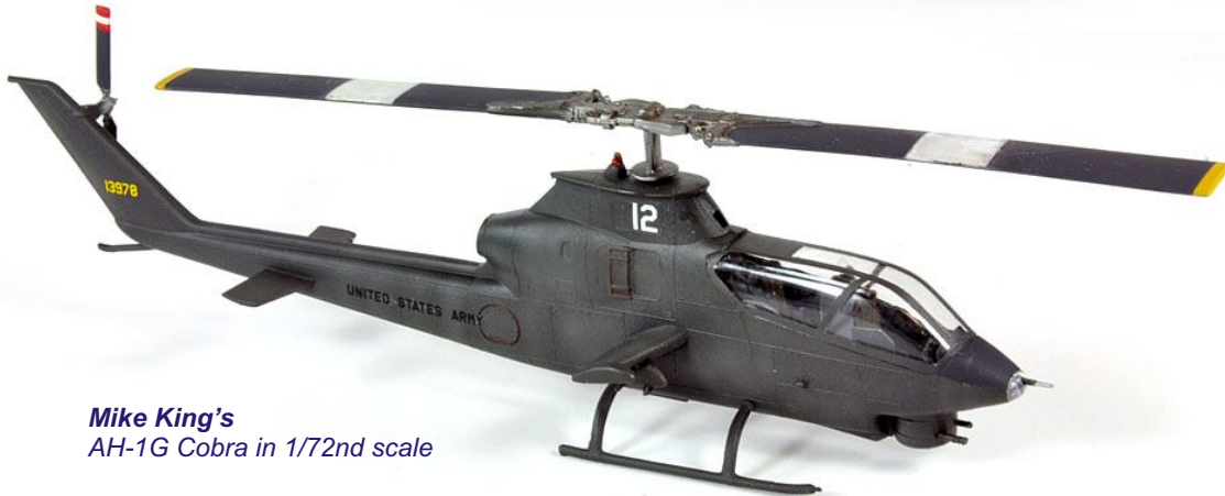
Mike King's AH-1G Cobra in 1/72nd scale

Duane Velasquez brought an A-Model Yak 25 NATO code named the "Flashlight" in 1/72nd scale. A neat built of a rather to most modelers, an obscure kit of an obscure aircraft.