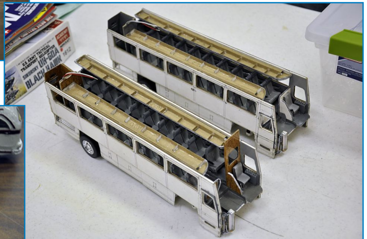
Jose C. Diaz's Work in progress paper busses in 1/32nd scale