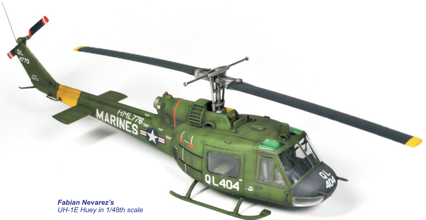
Fabian Nevarez's UH-1E Huey in 1/48th scale