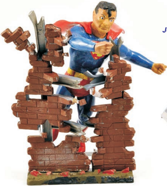
Jose Roldan's 1/8th scale Superman and 1/350th scale "SeaView"