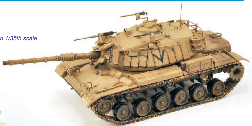
Carlos Delgado's M-60 Tank in 1/35th scale