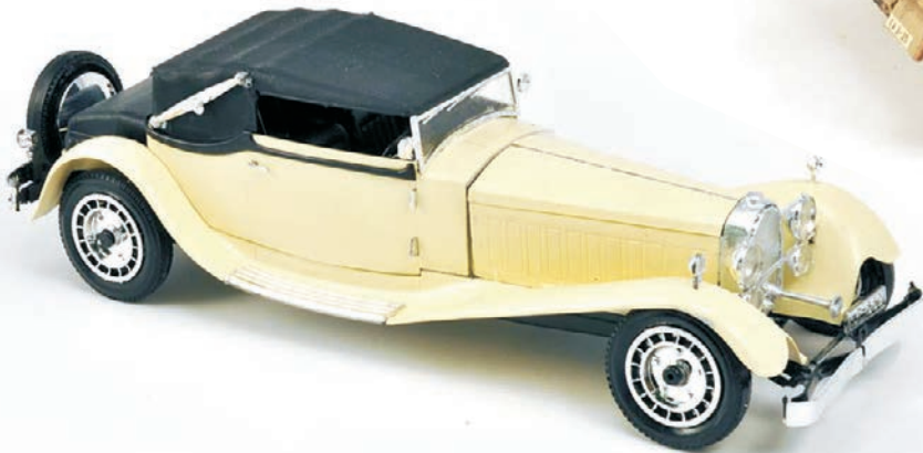
Steve Hennessee's 1/24th scale Luxury Convertible