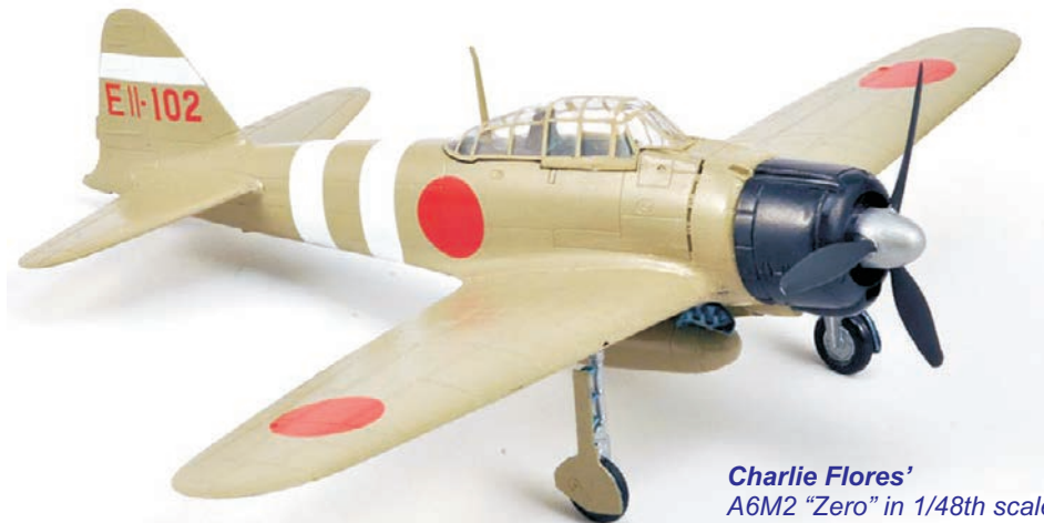
Charlie Flores' A6M2 "Zero" in 1/48th scale

By the way, the most interest shown in three or four months, now all john needs to do is finish them.